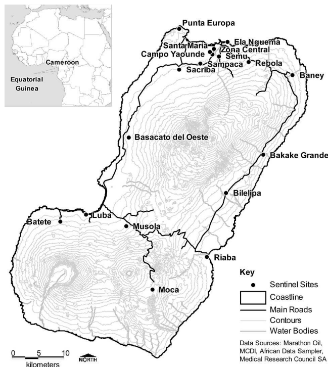
FIGURE 1. Location of sentinel sites used to monitor the Bioko Island Malaria Control Project intervention. MCDI = Medical Care Development International; SA = South Africa.

Validation of ICT rapid test results was carried out on a sample of 153 children. In addition to conducting the standard ICT malaria rapid test, thick and thin blood smears from each child were independently examined by three microscopists, and dried finger prick blood samples blotted on filter paper were assessed for the presence of P. falciparum DNA using a nested polymerase chain reaction (PCR) at The Medical Research Council laboratories in Durban, South Africa. 8,9