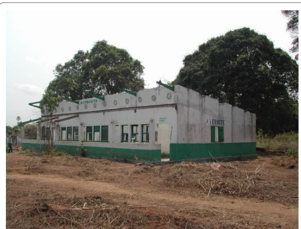
Figure 2 Loulambo, Pool region, Republic of Congo, 2003; a maternity ward destroyed by conflict.

Additional file 1, Table S1 shows programme contexts and settings. 22 programmes were in sub-Saharan Africa. Thirteen were classed as conflict and eleven as post-conflict. Most (21) were in rural locations including two in refugee camps. Most countries had endured decades of instability, with conflicts lasting an average of 18 years; MSF had typically been present for 17 years. Additional file 1, Table S1 shows estimated WHO/UNAIDS country