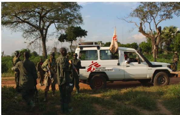
Figure 3 An MSF car in conflict-affected northern Uganda.

HIV prevalence data for 2005. Most countries were in Central and West Africa where prevalence is low to medium (1-10%) compared with higher rates in more stable southern Africa (10-50%) [18]. However, these rates usually reflect the situation in urban and stable areas where testing has been performed. In many of the areas where our HIV programmes were introduced there had been no prior HIV testing. ART coverage rates varied from 1% in Sudan to 51% in Uganda [see Additional file 1, Table S1] [19], but considerable in-country variation exists with rates as low as 2-122 per 1000 of eligible individuals receiving ART in conflict-affected regions of northern Uganda [4].