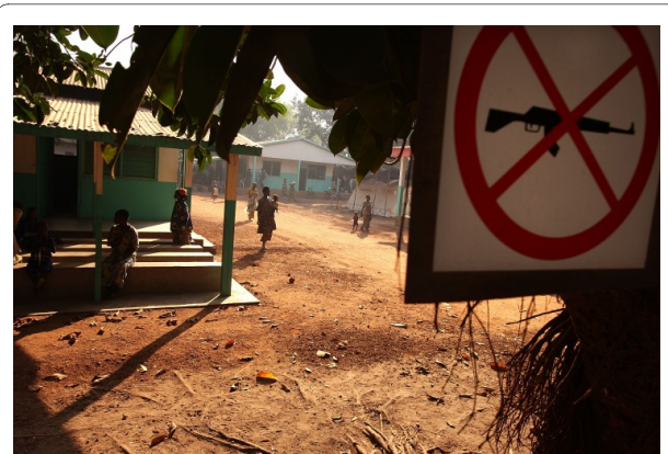
Figure 1 An MSF clinic in Kabo, Central African Republic, 2007; with a sign indicating "no guns allowed in the clinic".

An HIV programme was initiated in Bukavu, a conflict-affected region of eastern Democratic Republic of Congo (DRC) in October 2003 and expanded to 24 basic health-care programmes in 12 countries (Figure 4). We describe the contexts, activities, outcomes, challenges, and lessons learned from these programmes, including answers to common issues raised about potential difficulties in implementing such programmes. Our aim is to share the knowledge and experience obtained by MSF and its counterparts and to facilitate and advocate increased commitment for provision of HIV treatment in these settings.