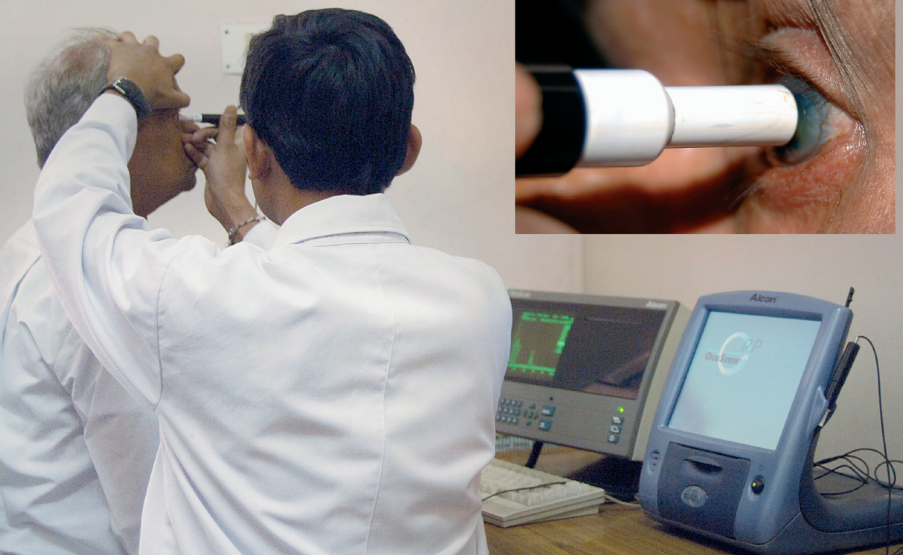
Figure 1. Photograph showing technique for applanation A-scan biometry

measures the time taken for sound to traverse the eve and converts it to a linear value using a velocity formula. Part of the ultrasound beam reflects back from each surface in the eye - cornea, anterior lens, posterior lens, and retina. The reflected beam is translated into an image showing lines (spikes) for each surface. The distance between the corneal and retinal spikes gives the axial length of the eye.