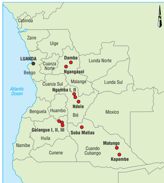
Fig 1 Name and location of 11 resettlement camps for former UNITA members and their families included in the survey. (Base map provided by ReliefWeb-UN OCHA on 30 January 2003; modifications by Epicentre on 31 January 2003)