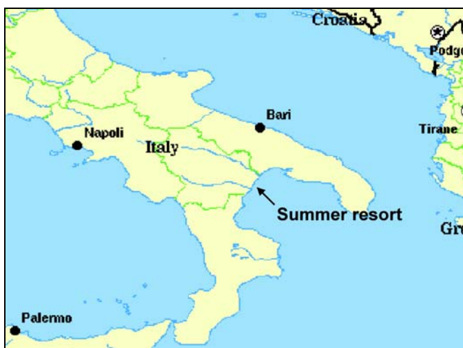
Figure 1. Map of Italy, showing location of tourist resort on Gulf of Taranto.

On July 18, 2000, the local health unit and the Institute of Hygiene of the Faculty of Medicine in Bari were notified about an outbreak of gastroenteritis at the resort. An epidemiologic investigation was initiated the same day to identify the agent and the mode and vehicle of transmission and to