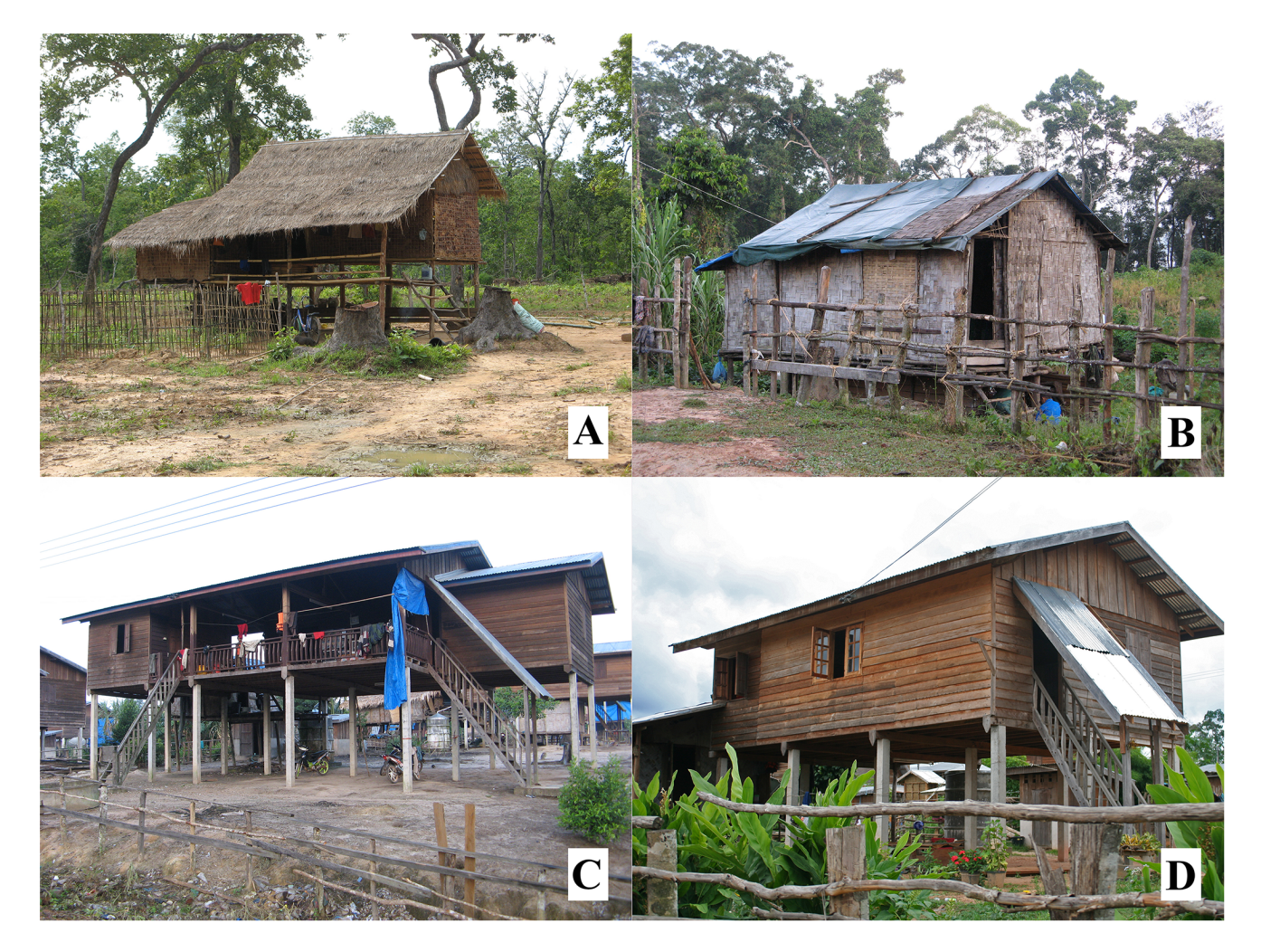
Figure 2. Typical resettlement and traditional houses in the study area. Traditional houses (A and B) are normally constructed from bamboo thatch with roofs made from thatch, wooden tiles or corrugated iron. Doors and windows are poorly fitting and there are many gaps in the walls and floors. Traditional houses are raised on stilts on average 1.27 m above the ground. Resettlement houses in contrast (C and D) are built from pre-dried hard wood with corrugated iron roofs. They generally have fewer gaps in the walls and floors then a traditional house and have well-fitting doors and windows. They are raised on stilts an average of 2.66 m above the ground. The houses shown in this figure are for illustrative purposes and may not have been sampled during the study. doi:10.1371/journal.pone.0062769.g002

with a 78% reduced risk of anopheline house entry compared with cooking in a separate room at the side of the house (IRR = 0.22, 95% CI: 0.10–0.51, P<0.001). Ownership of a cow more than doubled the risk of anopheline house entry compared with houses not owning a cow (IRR = 2.32, 95% CI: 1.29–4.17, P = 0.005).