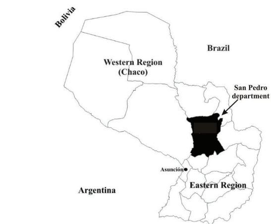
FIGURE 3: Map.

3.2. Patients. Twenty-five patients or their carers were interviewed (Table 1). Most (60%, 15/25) were farmers while 12% (3/25) were housewives, 8% (2) traders, 4% (1) labourers, 4% (1) in private business, and 4% (1) military or police. Many patients (44%, 11/25) travelled to their health centre by walking. Other modes of transportation included public bus