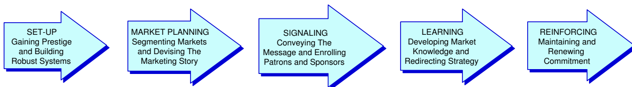
Figure 1 Five stages in marketing a trial.

Clinical trials require strategy, management, marketing and sales. Undoubtedly they undertake the activities listed in the table 1 in some way. However, what happens if those who define the strategy of a trial, establish its management processes, devise its marketing plan and attempt to sell the benefits of participation try to improve their practice by explicitly engaging with the discipline of man-