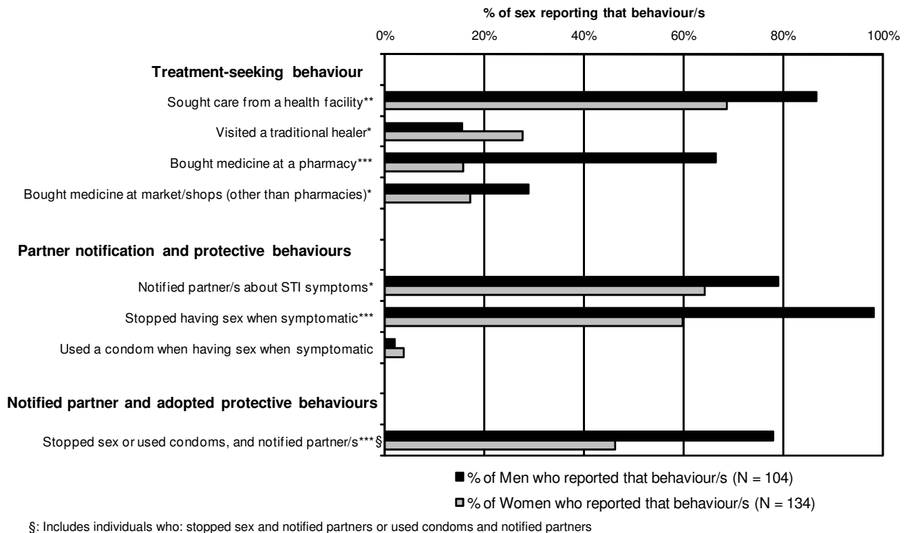
Figure 2 Treatment-seeking and partner notification/protection among symptomatic individuals, by sex of respondent. The 104 men and 134 women who reported genital discharge and/or ulceration in the past 12 months were asked if they adopted any of these behaviours when having STI symptoms; note that each respondent could report more than one behaviour. We also present the proportion that adopted a combination of appropriate behaviours – either stopping sexual intercourse or using a condom, plus notifying their partner regarding their symptoms. Items where the proportions differ significantly between genders are annotated (***) p < 0.001 , ** p < 0.01 , * p < 0.05 ).

women citing non-healthcare information sources was higher than for the men (17.8% in women vs 8.2% in men, see Table 3). None of the sociodemographic or behavioural factors (age, religion, educational level, time in refugee camp, marital status and age at first sexual intercourse) were found to be associated with better knowledge about STI symptoms in either men or women.