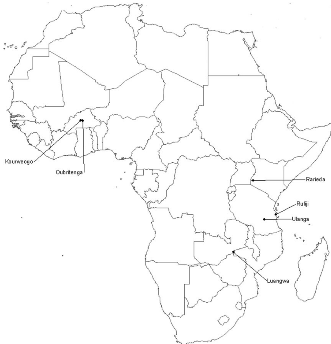
Figure 1 Map of Africa showing locations of study sites

observations were recorded by a field worker who sat in a randomly selected compound and recorded the number of people who were awake at hourly intervals from 6.00 pm until all of them retired indoors. A similar procedure was used in the same compound from 4.00 am to 6.00 am on the following morning. In the MTC study, four questions were incorporated into standard cross-sectional malaria indicator survey questionnaires asking when, to the nearest hour, the respondent went indoors for the night, went to bed to sleep, awoke in the morning, and left the house in the morning.