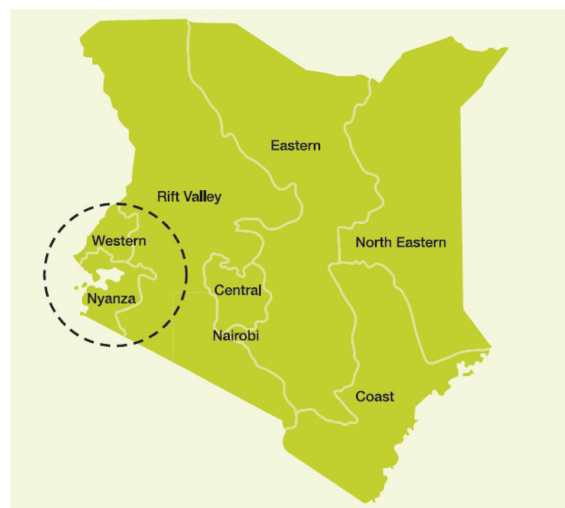
Figure 1 Study setting: Nyanza and Western Provinces, Kenya.

We recruited males who were 2–60 years of age, capable of signing an informed consent or having a guardian (or parent) willing to sign the document, willing to return for postoperative follow-up visits, willing to undergo physical examination of the penis after circumcision, and capable of answering questions about the male circumcision procedure, sexual activity, and condom use (if applicable). Individuals with known health problems or diseases which might cause adverse events, such as hemophilia and genital ulcer disease,