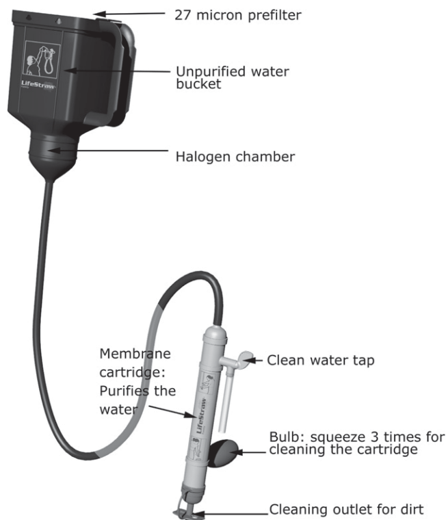
FIGURE 1. Schematic of device.