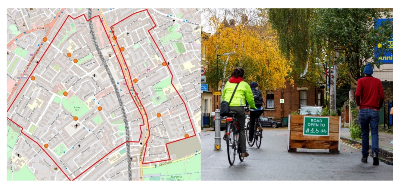
Figure 1: An example of a low traffic neighbourhood in Walworth, Southwark.

Left side: New modal filters in 14 places (orange dots) create two low traffic neighbourhoods (red) in Walworth, South London. All homes can be accessed by motor vehicle, but one cannot drive straight through the area. Right side: An example of one of the Walworth modal filters, which blocks motor traffic while allowing pedestrians and cycles to pass freely. This modal filter uses physical barriers, but other modal filters are enforced with cameras.