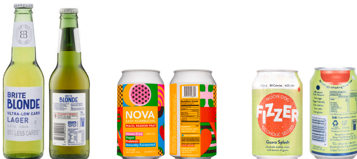
Fig. 2. Example products with full nutrition information panels shown to participants during the focus groups.

generally considered an appropriate method of drawing attention to information that is likely to be relevant to this growing segment of the population.