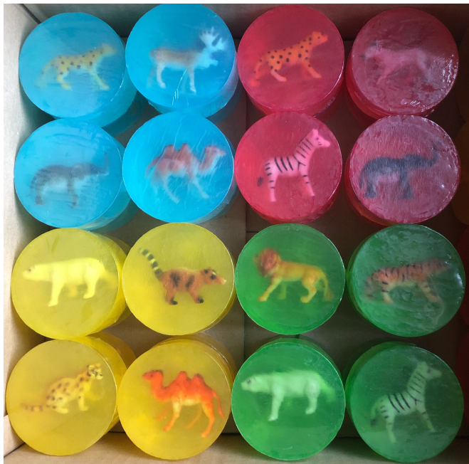
Figure 1 Surprise Soap image.

Soap bars to the children, explaining that the more often they wash their hands with the soap, the faster they will reach the toy inside, and listing five key handwashing times (before eating, before preparing food, before serving food to another person, after using the toilet and before cleaning another person's faeces). The hygiene promoter then demonstrates the ideal handwashing technique, inviting the children to practice washing the glitter from their hands using the Surprise Soap, and then finally leaving a parcel of five Surprise Soaps with the children in the household (parcel directly handed to a child). At least one adult, usually a caregiver, was present during intervention delivery but they were not personally instructed on the use of these toy soaps. On the same day, directly after the 4 weeks, 12 weeks and 16 weeks follow-up household observations, the hygiene promoters visited the households again to distribute further packages of Surprise Soap but did not repeat the household session. Soap packages all contained soaps with different toy animals so that the children did not receive the same toy twice over the intervention period. No handwashing messages were delivered during these follow-up visits.