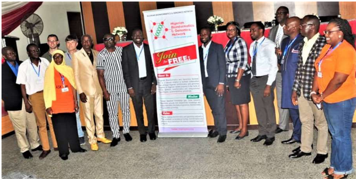
Fig. 1. NBGN inauguration ceremony. Picture of NBGN pioneer executives, keynote speakers, invited dignitaries, and some members of NBGN taken during the inauguration ceremony on Wednesday 26 June 2019.

bioinformatics and genomics investigators. NBGN aims to advance and sustain the fields of genomics and bioinformatics in Nigeria by serving as a vehicle to foster collaboration, provision of new opportunities for interactions between various interdisciplinary subfields of genomics, computational biology and bioinformatics, provide opportunities for the early career researchers.