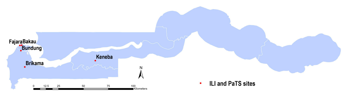
Figure 1. A map of The Gambia showing sites where participants were recruited for the two studies. The PaTS study sites were in Brikama, Bundung, Bakau and Fajara. The influenza-like illness (ILI) study sites were in Keneba and Fajara.

SARS-CoV-2 was detected using a Reverse Transcriptase Polymerase Chain Reaction (RT-PCR), with either the Takara One Step PrimeScript III RT-PCR Kit (TaKaRa Bio Inc., Japan, catalogue number RR600A) or the SuperScript III Platinum One-Step qRT-PCR Kit (Invitrogen, USA, catalogue number 11732-088). Primers and probes targeting SARS-CoV-2 E and N genes, along with RNase P and PhHV were used previously described4. Samples were considered positive if all four gene targets amplified at a cycle threshold (Ct) of 37 or below. In addition, a viral multiplex RT-PCR assay was used as previously described8 to detect influenza A and B, respiratory syncytial virus (RSV) A and B, parainfluenza viruses 1-4, human metapneumovirus (HMPV), adenovirus, seasonal coronaviruses (229E, OC43, NL63) and human rhinovirus. All samples with a Ct of ≤37 and passed quality control measures were considered positive.