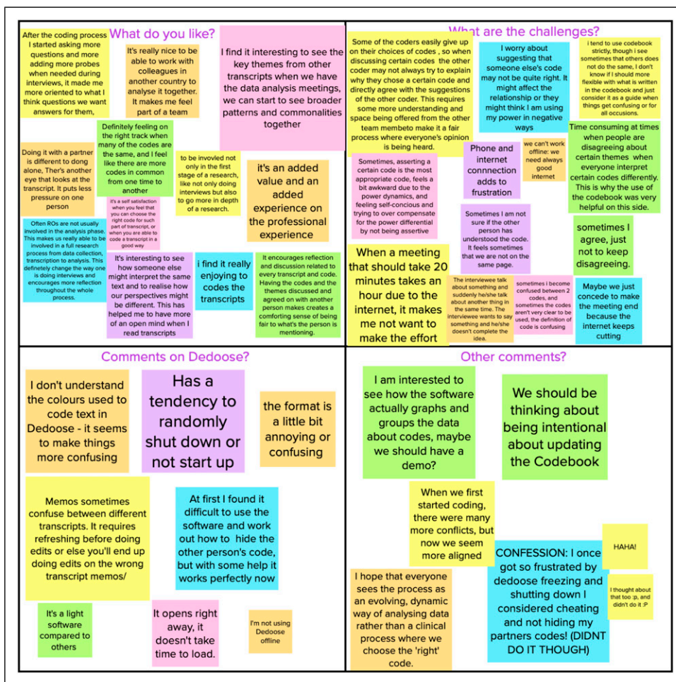
Figure 1. Mural reflection session.

added that ‘having two people do the coding makes it [sic] a kind of a balance.’