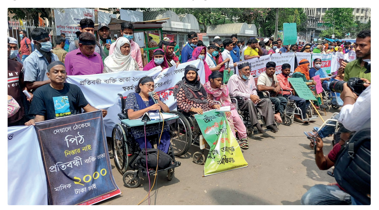
Figure 11. Human Chain formed to demand disability rights