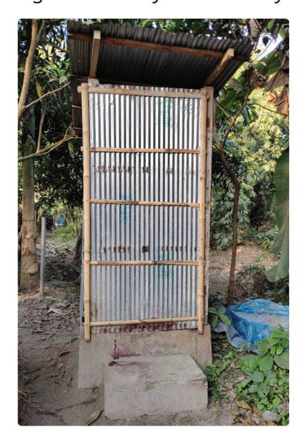
Figure 8. Safety and security

"Our toilet is not suitable for a person like me. It does not have any features for the physically challenged person."