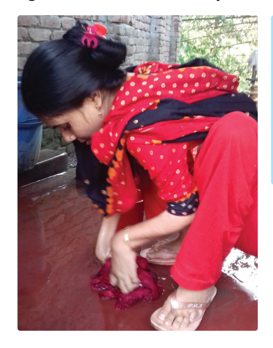
Figure 9. Inaccessible laundry area

"The washing area is too narrow, which is out of my comfort. I need a high place where I can wash my own clothes like other members of my family."