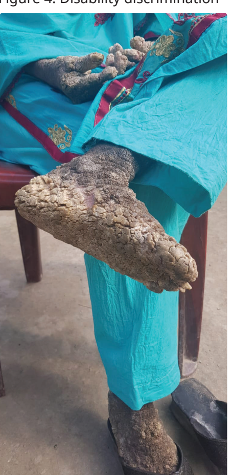
Figure 4. Disability discrimination