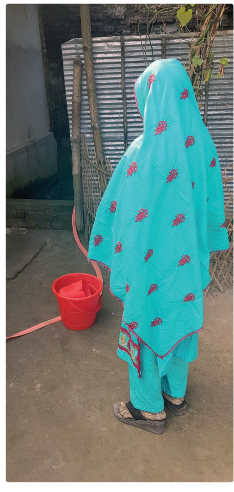
Figure 5. Water quantity