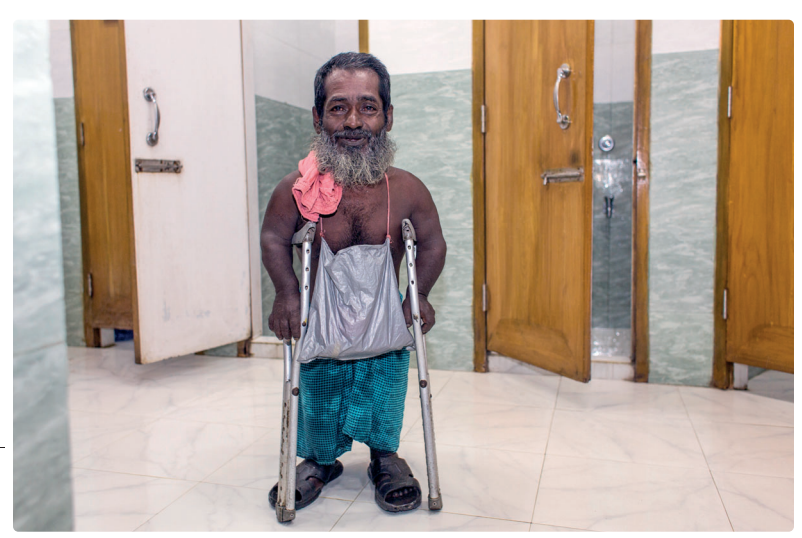
Figure 3. Yunus (70), with his happy face after accessing public toilet at Sayedabad bus terminal, Dhaka

People with disabilities, regardless of impairment experienced, can collect water and use the toilet and bathing shelter independently or with caregivers' support in public and private settings.