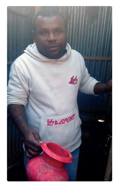
Figure 7. Inaccessible latrine

"Because we have a squat toilet with no facilities for water supply, I require assistance while using it. When no one is around, I try to find the footplates on the toilet pan with my hands before placing my feet on them to prevent any unwanted mishaps."