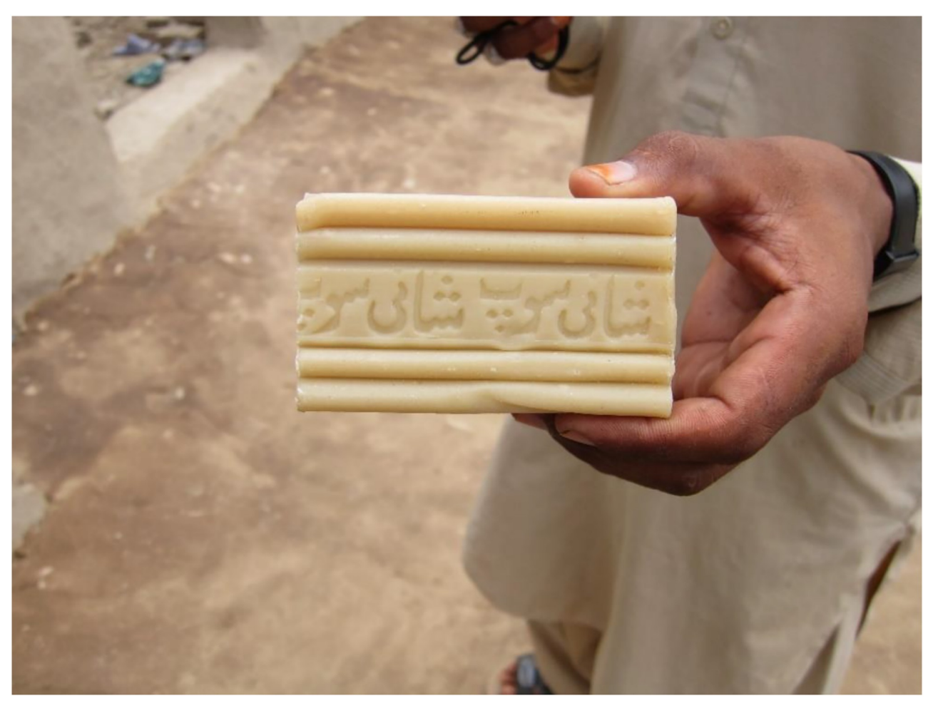
Fig 1. "This makes me feel very happy and clean. I use it all the time to manage my smell. It cleans my clothes, and it cleans my hands and the most important thing is that it keeps me clean."—Photo and caption by a PWI, urban area.

https://doi.org/10.1371/journal.pone.0271617.g001