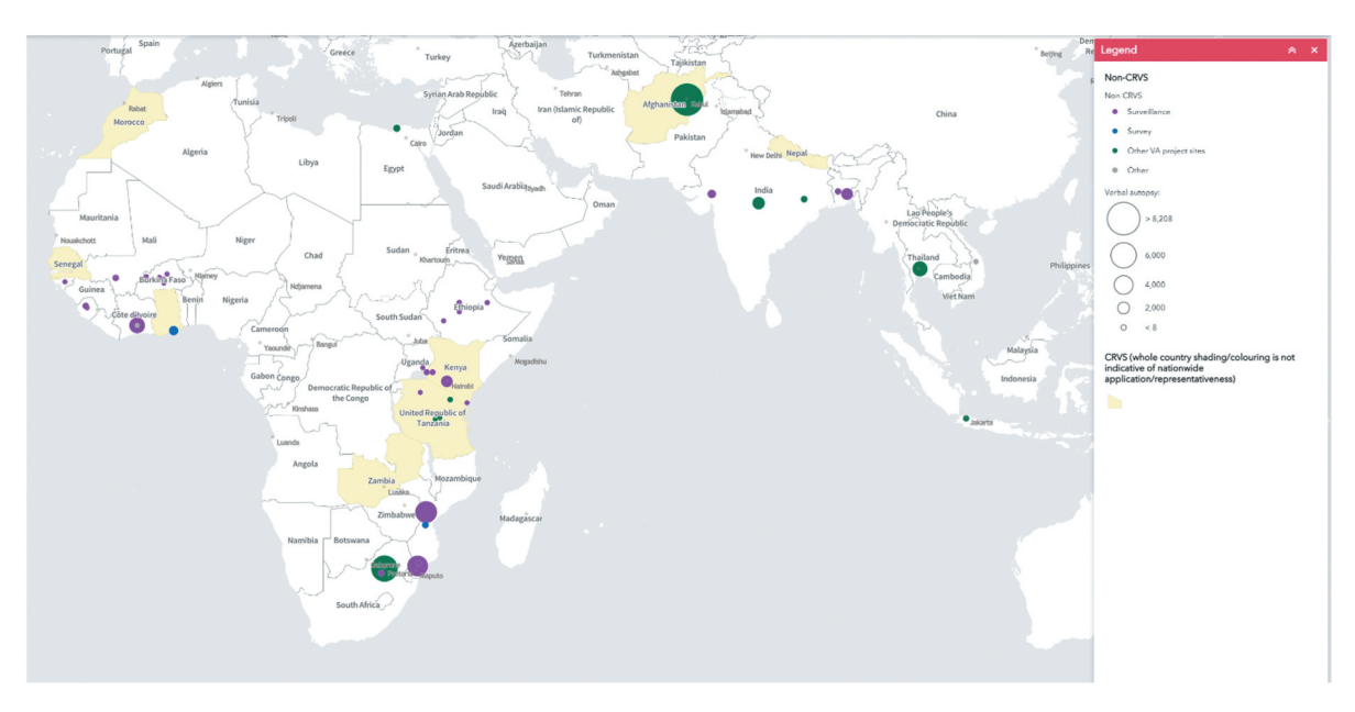
Figure 3. Map of applications of WHO Verbal Autopsy in research surveys, demographic surveillance (circles) and in national CRVS systems (country shading).

Beyond the large network of INDEPTH HDSS research sites, almost all new multi-country research projects and field trials that need cause-specific mortality data on large study populations are now using the 2016 WHO VA Standard or an adaptation of it along with its associated diagnostic algorithms. For example: