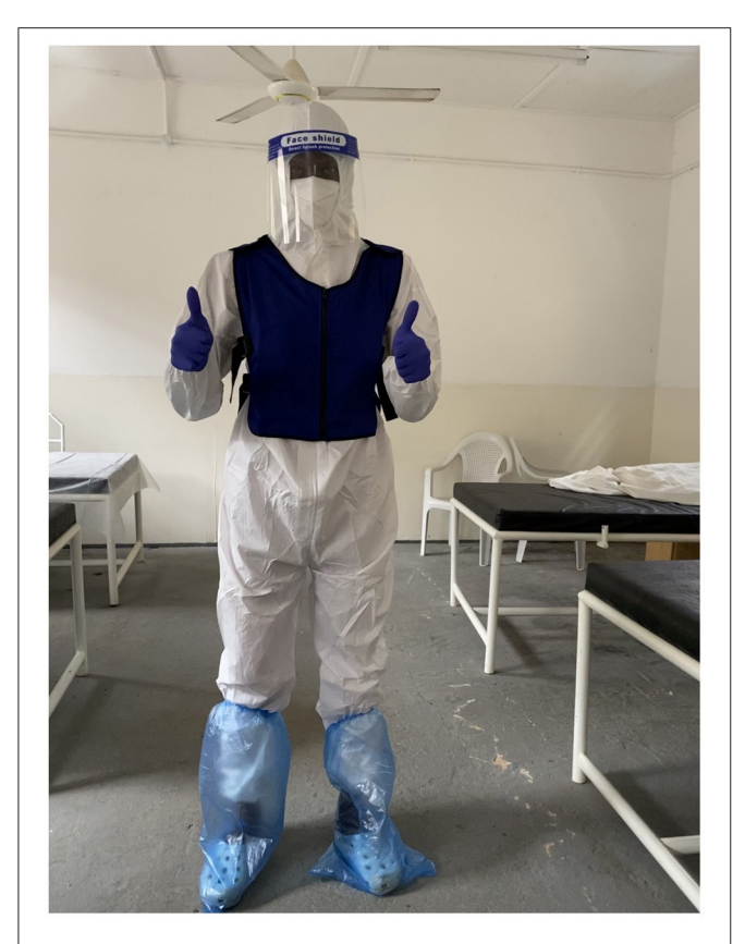
FIGURE 1 | A participant in full PPE with ice vest.