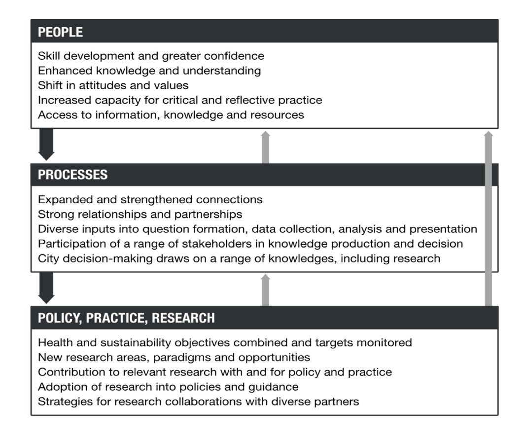
Figure 2. Change model for Complex Urban Systems for Sustainability and Health ('CUSSH'). Dark arrows are feed-forward. Light arrows are feedback.