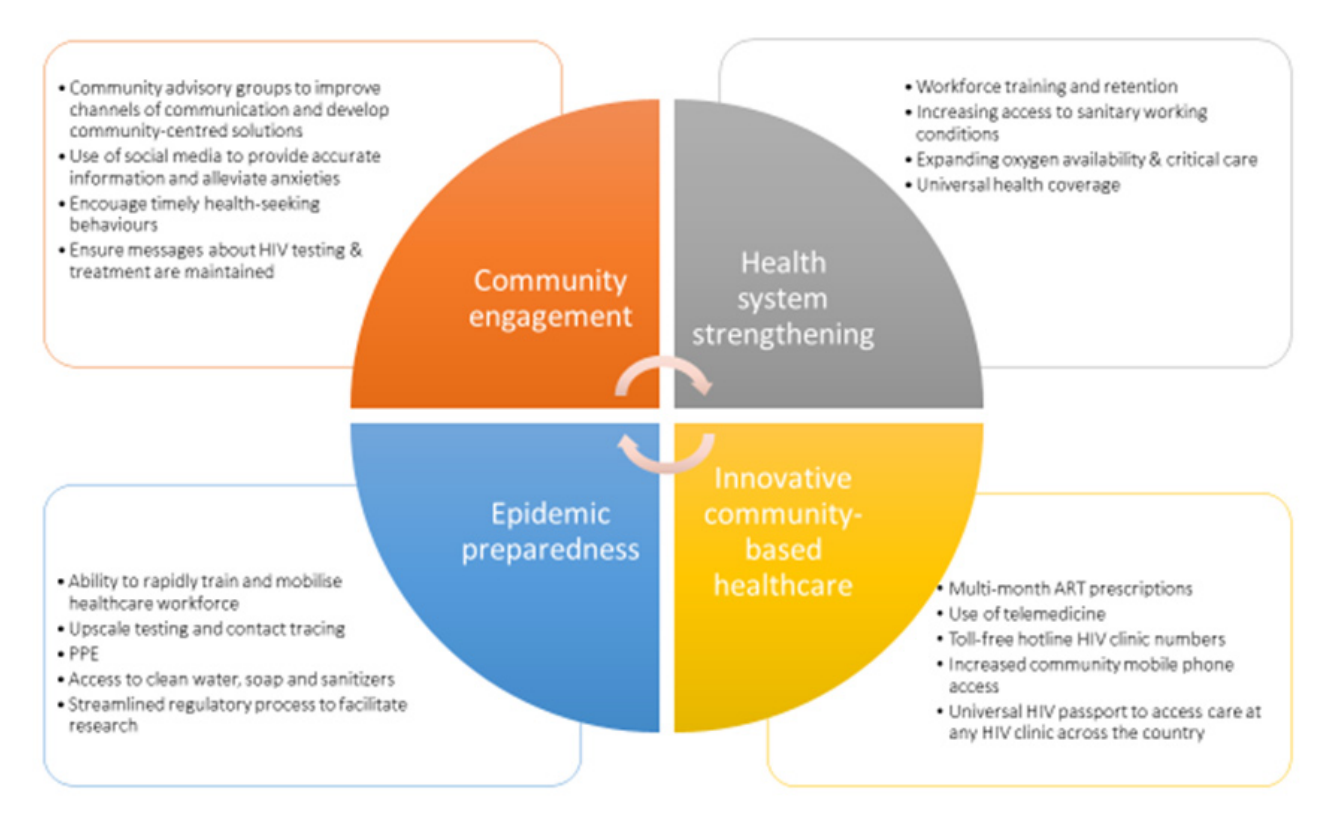
Figure 2. Suggested solutions to mitigate some of the major impacts of COVID-19 to HIV care and health systems and management of future pandemics. COVID-19 -Coronavirus disease (2019), ART- Antiretroviral therapy, PPE - Personal Protective equipment.

laboratory equipment and provision of increased high-dependency unit beds and oxygen supply within government healthcare facilities, the only healthcare available to most Ugandans.