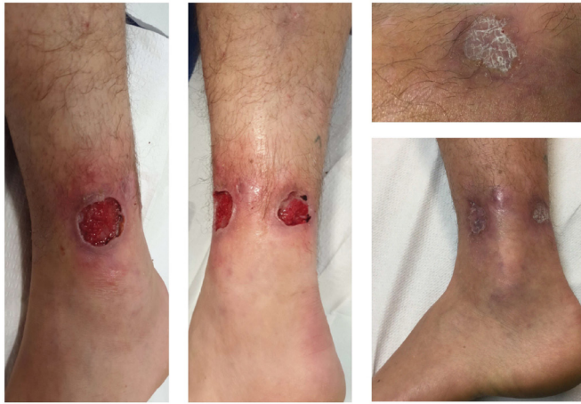
Figure 1 Clinical photographs of the ulcers prior to treatment with intravenous ceftazidime, oral co-trimoxazole and negative pressure dressings and after.

patient's extensive travel through Southeast Asia. He had travelled from Indonesia, the Philippines, Vietnam, Cambodia, Thailand, Nepal and India.