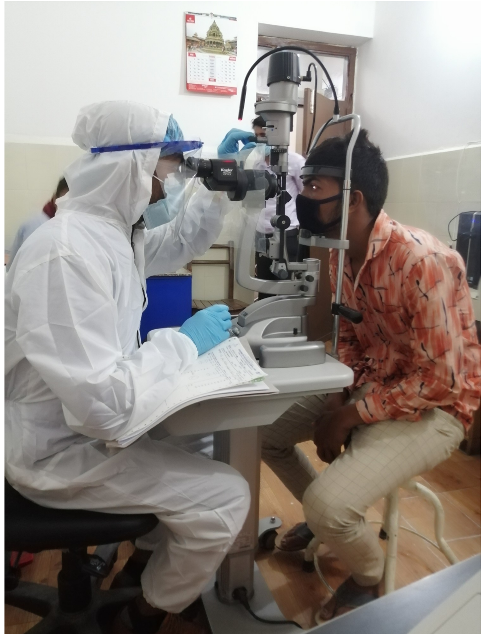
Fig 2. An example of PPE as worn by an ophthalmic assistant in the Eastern Region of Nepal, during the COVID-19 pandemic.

https://doi.org/10.1371/journal.pone.0254761.g002