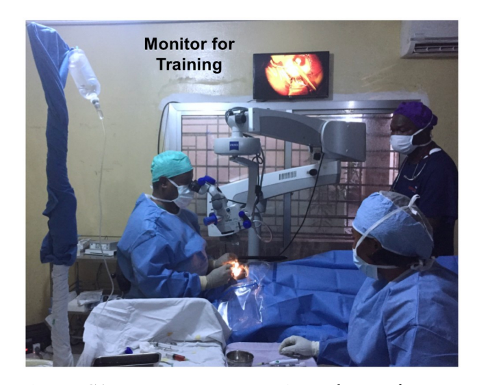
Fig 3. EVICT cataract surgery room setup. Aqueous humor and vitreous procedures were performed with an operator and assistant in full personal protective equipment (PPE). Infectious Diseases specialist monitoring was essential to ensure proper infection prevention and control precautions during the procedure, with specimen handling and during the donning and doffing of PPE. Sierra Leone observers and technical staff in PPE were also present for interpretation and observation of the procedure for training purposes. Following the ocular fluid sampling procedure, once Ebola virus RT-PCR testing of aqueous humor yielded negative results, manual small incision cataract surgery MSICS) could be performed in surgical PPE as shown. A video monitor was attached to the surgical microscope for additional education and teaching purposes.

https://doi.org/10.1371/journal.pone.0252905.g003