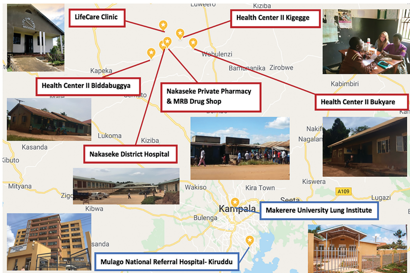
Figure 1. Map of Urban and Rural Study Settings Where Semi-Structured Individual Interviews Were Conducted 24

For personal use only. Permission required for all other uses.