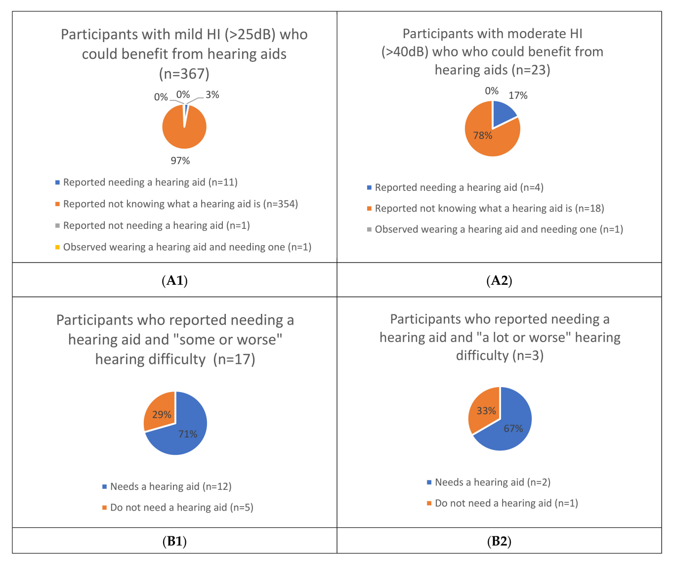
Figure 2. Comparing reported versus clinical impairment assessment unmet/undermet need for hearing aids for both mild and moderate hearing impairment (HI). ( A1 ): Participants with mild HI (>25 dB) who could benefit from hearing aids (n = 367), ( A2 ): Participants with moderate HI (>40 dB) who could benefit from hearing aids (n = 23), ( B1 ): Participants who reported needing a hearing aid with "some or worse" hearing difficulty (n = 17), ( B2 ): Participants who reported needing a hearing aid with "a lot or worse" hearing difficulty (n = 3).

did not (see Figure 2(B1)). Of the three people who self-reported needing hearing aids with "a lot or worse" hearing difficulty, two (67%) actually needed hearing aids based on clinical assessment and one (33%) did not (see Figure 2(B2)).