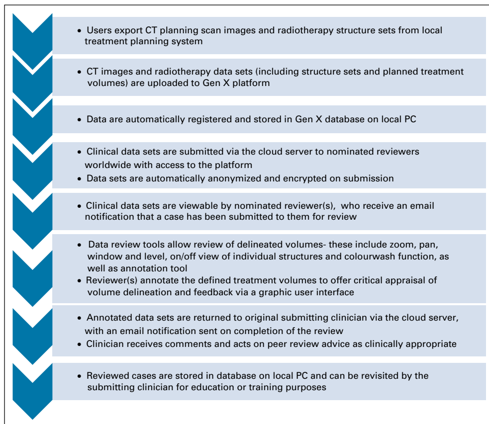
FIG 1. Gen X Cloud Platform Functionality. CT, computed tomography.

For the initial needs assessment, we reviewed the existing radiotherapy treatment facilities, including treatment machines,