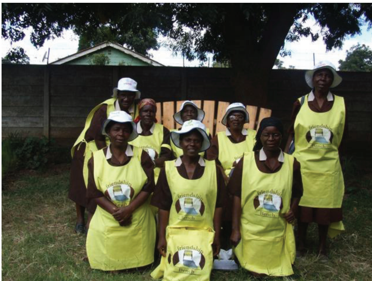
Figure 1 Some of the lay health workers involved in the Friendship Bench project, sitting in front of one of the Benches.

registered as a non-controlled trial http://www.controlled-trials.com/ISRCTN25476759