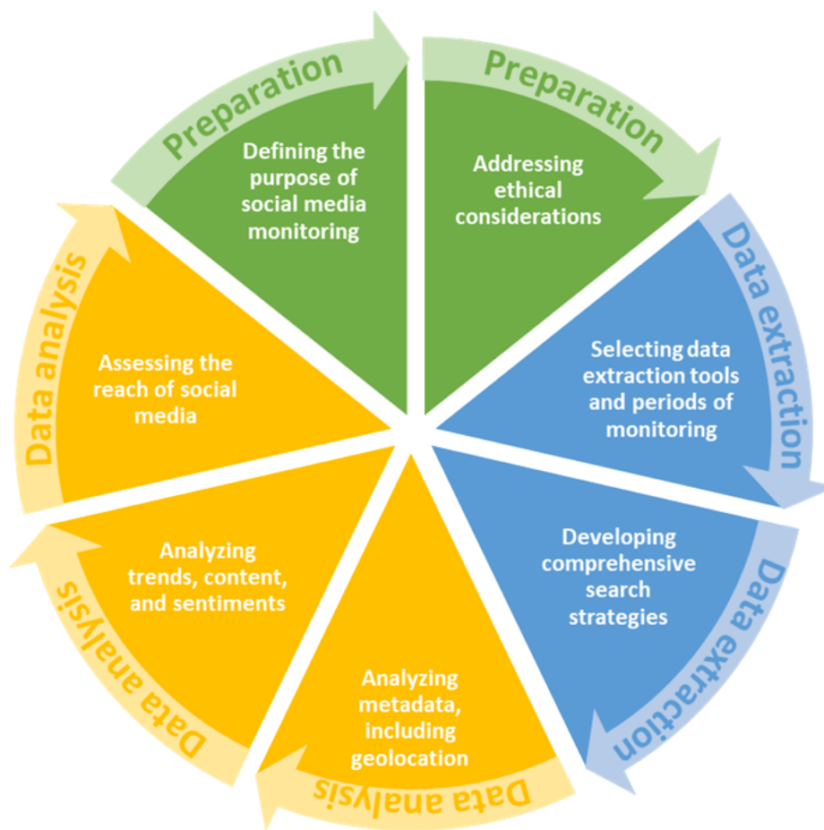
Figure 1. The three-step model of social media monitoring.

Three researchers summarized, charted, and analyzed the data. A descriptive analysis was conducted for the types of data collection tools used to gather data from social media, the keywords and search strategies used, and the various analytical methods. These researchers reviewed and compared results in the data extraction sheet, listed and identified the frequency of different methods used for social media monitoring, and identified common themes. Two researchers met to discuss the findings and interpret them together with contextual information, identifying needs for further research.