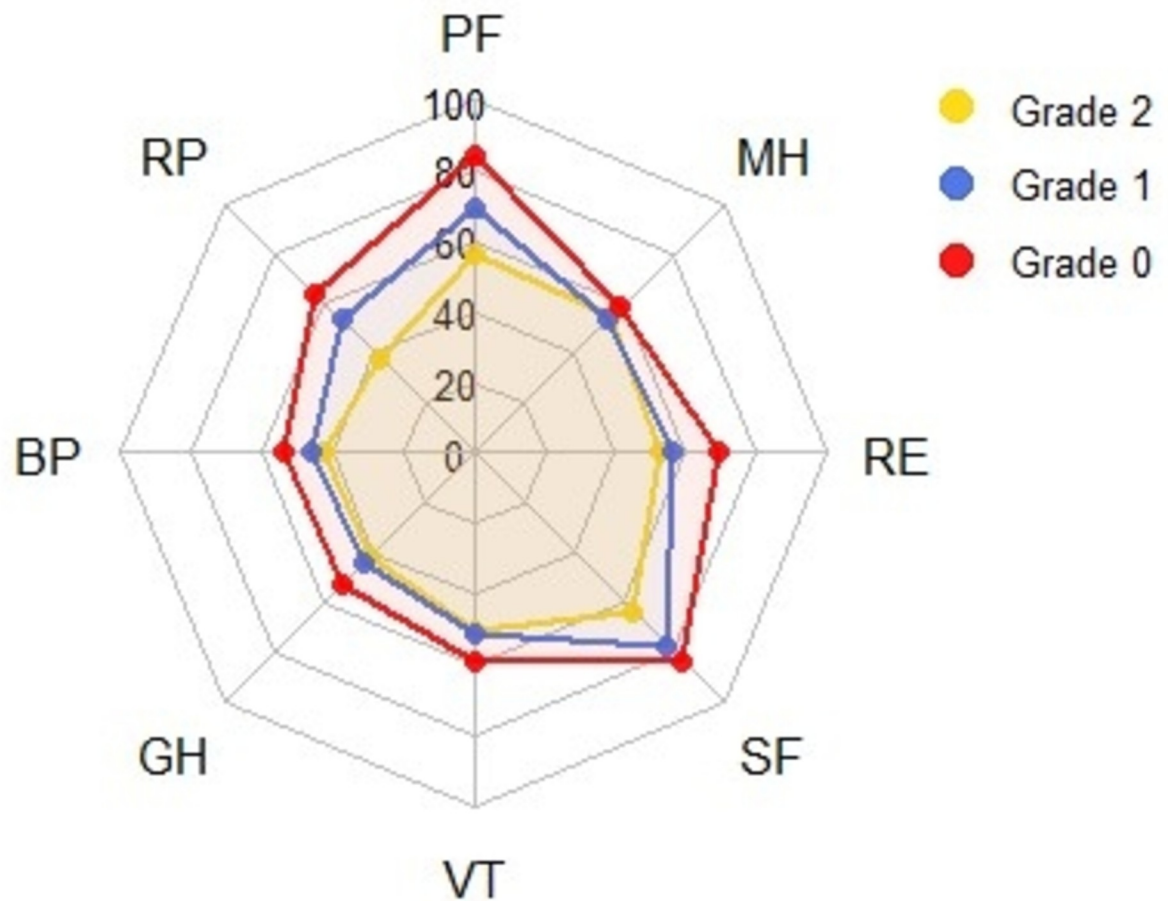
Fig 3. Spider plot of reported SF-36 domain scores by the grade of disability. PF- Physical Function, RP- Role limitations (physical), BP- Bodily Pain, GH- General Health, VT- Vitality, SF- Social Functioning, RE- Role limitations (emotional), MH- Mental Health.

https://doi.org/10.1371/journal.pntd.0009209.g003