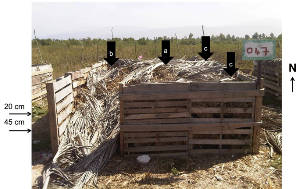
Fig 1. Compost bin sampling locations. Example of a SOIL compost bin, showing sampling locations and depths. Samples were collected in all bins from the a) center and b) northwest corner. Samples were also collected from the c) northeast and southeast corners in the bin with newly added latrine waste (Bin 1). The southwest corner was not sampled due to a lack of compost at the opening.