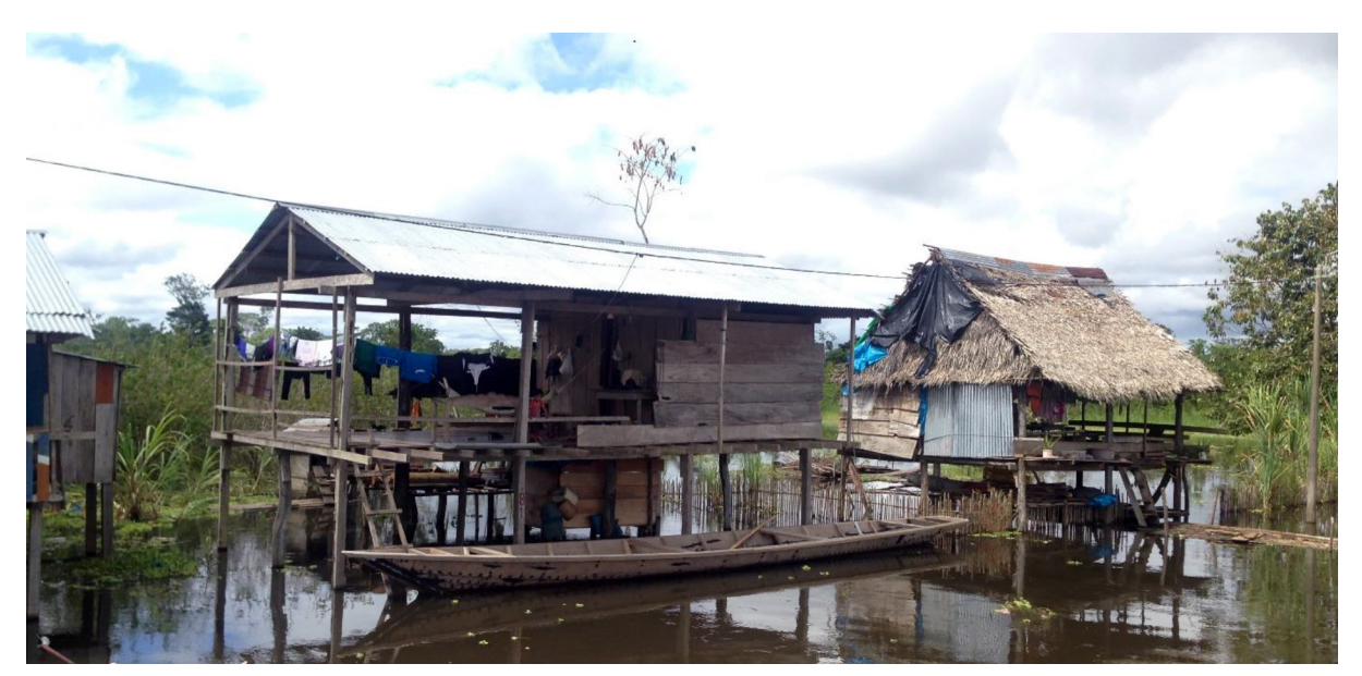
Figure 3 Wooden housing in the Peruvian Amazon during high river levels.

A 2-year programme evaluation with repeated household censuses and an in-depth mixed methods process evaluation is currently undertaken within a wellcharacterised study area. MDR is implemented in the rural areas of three districts ( Nauta, Parinari, Saquena ) in Loreto, covering 79 predominantly native communities of Kokama-Kokamilla ethnicity with a population of 14 474, almost half (44%) between 0 and 14 years old and 10% above 60 years of age. Communities are physically separated settlements dispersed along 350 km of the Amazon river or its subsidiaries (figure 2) within dense tropical rainforest and difficult access by boat only. Villagers live