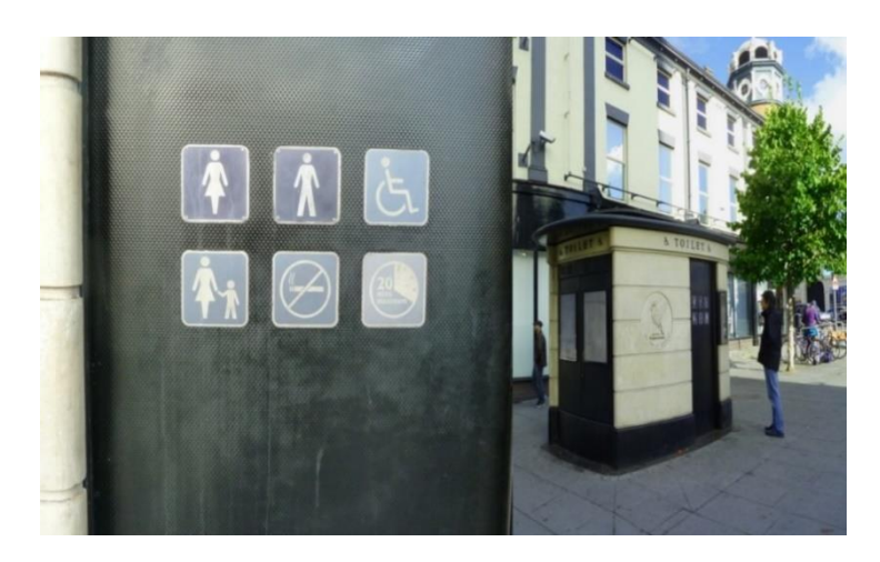
Figure 9. Example of public toilets hindering respect and social inclusion (P1) (Bold Street, Liverpool).

'This toilet's not inviting, it's not accessible ... and I'll be a bit anxious about getting locked in ... It's counterproductive to meeting the needs of older people. Your body is changing and you've different needs ..., but you need immediate access to clean toilets. It's against social inclusion. It's a barrier because not many older people will be confident to go to the city centre if there're not enough accessible public toilets.' (P1, 65, M, Group 1) (Figure 9)