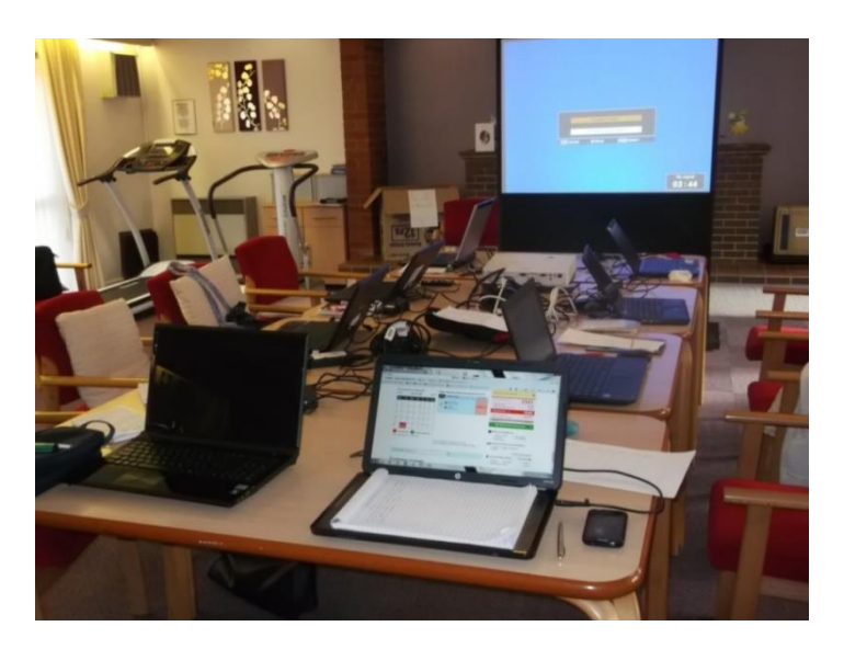
Figure 18. Example of a computing classes promoting respect and social inclusion (P21) (St. Luke's court, Liverpool).

IT training was often facilitated by community organisations (Figure 18) and libraries (Figure 19), which created a supportive environment in which older people felt encouraged to learn.