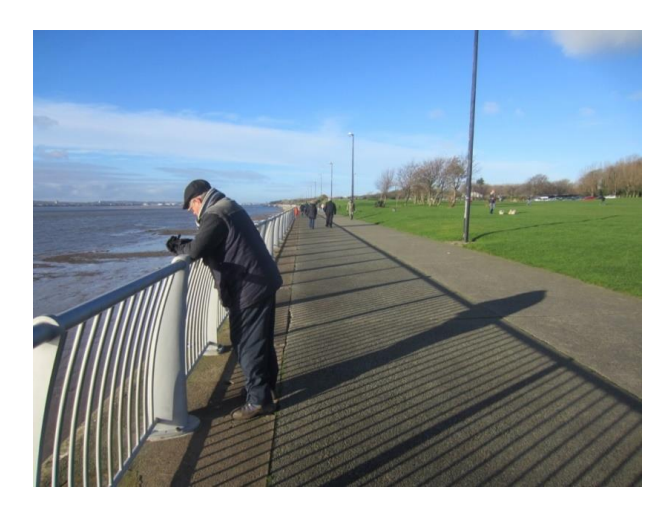
Figure 3. Example of green spaces promoting respect and social inclusion (P17) (Otterspool Promenade, Liverpool).

Paved, flat and accessible walking paths and parks were believed to be particularly important not only for older people, but for everyone with functional limitations or disabilities (Figure 3).