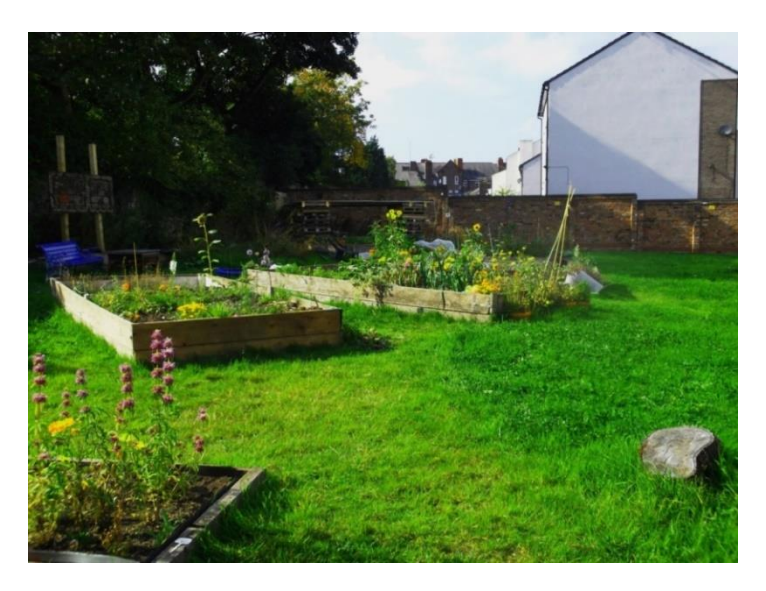
Figure 4. Example of a community garden promoting respect and social inclusion (P3) (Ferngrove community garden, Liverpool).

'People of all ages can access it, there's parking, so you can walk down and on a nice summer's day people of all ages are out, [...]... it's a good place to go and have a good walk and take the fresh air... we're lucky in the South end of Liverpool that we have something like this'. (P9, M, 71, Group 2) (Figure 4)