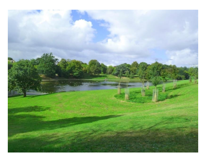
Figure 2. Example of green spaces promoting respect and social inclusion (P1) (Sefton Park, Liverpool).

Green and blue spaces were the most photographed and talked about places by participants across the four groups. They offered (free) opportunities to do physical activity and provided a space for multi-generational interactions (Figure 2).