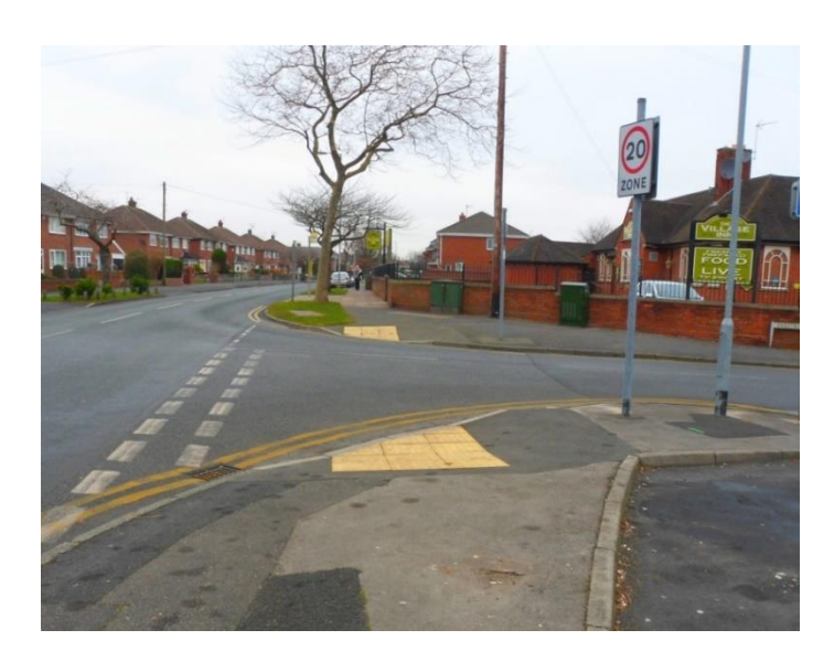
Figure 10. Example of sidewalks promoting respect and social inclusion (P23) (Road, Liverpool).

'These little bumps ensure safety when there's bad weather. For some people, just stepping off the side is not much, but when you've got bad legs, it is awful; so, if you have these bumps to help you getting around, then it helps you in the community; you can actually get out more, and you can socialise a bit more [...]'. (P23, F, 70, Group 4) (Figure 10)