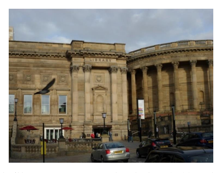
Figure 12. Example of libraries promoting respect and social inclusion (P15) (Central Library, Liverpool).

'This is the library. I like books and inside it's absolutely beautiful ... we have such a lovely facility here [ ... ] it's lovely to have a look and see whatever you want to see ... it's open for anyone in Liverpool to go in, so it's not local community but it's for the community of Liverpool'. (P15, F, 64, Group 3) (Figure 12)