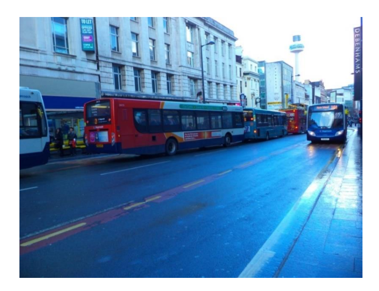
Figure 6. Example of transportation options promoting respect and social inclusion (P20) (Buses in Liverpool city centre).

'I really appreciate our very good bus and train services. [ . . . ] I can come out in the morning and I can get on a bus and go to so many places, and I don't have to wait long for a bus. It gives me freedom: freedom to get out. We are so lucky! Buses and trains are such a vital part in our lives.' (P20, F, 81, Group 4) (Figure 6)