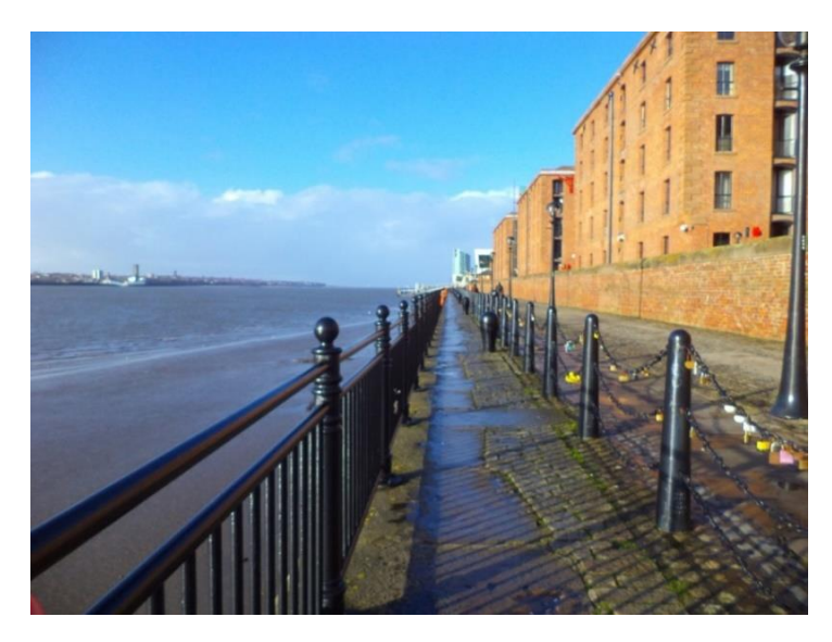
Figure 5. Example of blue spaces promoting respect and social inclusion (P20) (Albert Dock, Liverpool).

The combination of accessibility, affordability and sociability of green and blue spaces contributed to participants' mental wellbeing, feeling of inclusion and sense of connection.