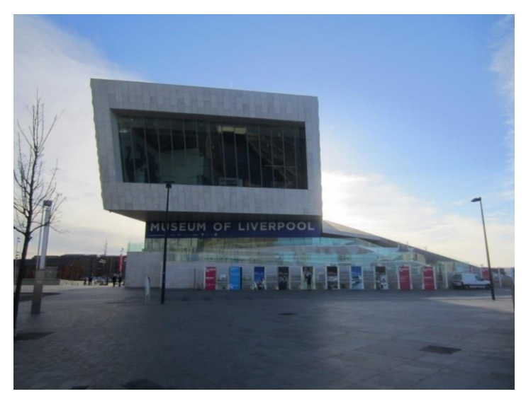
Figure 13. Example of museums promoting respect and social inclusion (P15) (Museum of Liverpool).