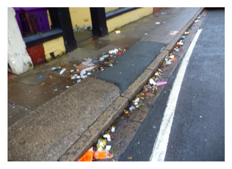
Figure 11. Example of litter in the street hindering respect and social inclusion (P20) (Road, Liverpool).

'This lowers the tone of the neighbourhood. I think I live in a quite nice neighbourhood [...] the bin man's just been ... but that mess is still there. [It] does not engender any respect in the young. The young see that and think "well, everyone else is throwing away their rubbish". [...] The people who live there should be aware of it [...] There's no respect for yourself or for anyone else with that around.' (P20, F, 81, Group 4) (Figure 11)