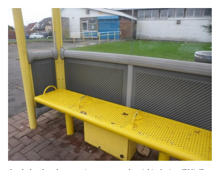
Figure 16. Example of a bus bench promoting respect and social inclusion (P23) (Bus stop, Liverpool).

'This is the new bus shelter and [the council] provided seating again. [...] that is very good because [...] you can rest while you're waiting for the bus, you can get chatting to people, and you also are covered from the wind. [...] it's part of the community because you get to be more sociable if you're sitting down, and you will talk to people'. (P23, F, 70, Group 4) (Figure 16)