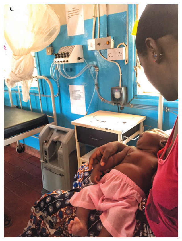
Figure 2. Solar-PS systems in the field. Panel A: Standard Solar-PS systems in situ in AFPRC Hospital, Farafenni, The Gambia. Panel B: Trailer Solar-PS system installed at Soma Health Centre, Soma, The Gambia.*Wheels were subsequently removed and fence erected to deter theft. Panel C: Trailer Solar-PS system supplying oxygen to a child in Soma Health Centre, Soma, The Gambia. *Photograph used with permission of caregiver.