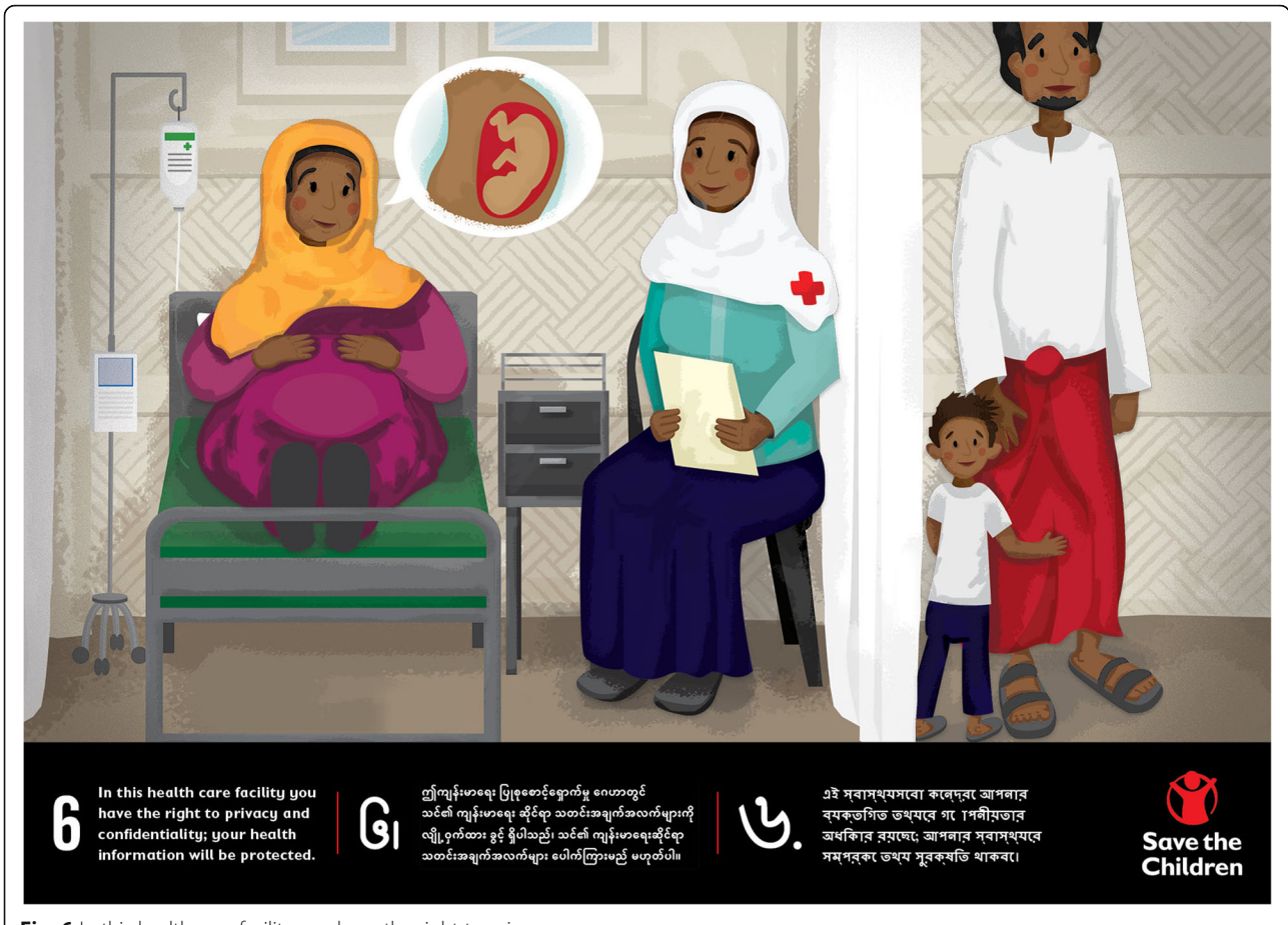
Fig. 6 In this health care facility you have the right to privacy

convey, we were unable to reconvene the original focus groups, nor were we able to carry out the back translation of the images (to determine if community members could tell us what was being depicted in the illustrations without referring to the rights as written). Operationalising even the most basic activities in an emergency is logistically complicated; however, in this setting routine operational challenges were compounded by the nature of the emergency (and the associated infection prevention and control measures) and the standard restrictions on camp access (e.g. access hours were limited for international staff). These factors, in addition to competing demands and time constraints, prevented us from determining if the illustrataions faithfully depicted the visual elements described to us, and from carrying out the back-translation as originally planned.