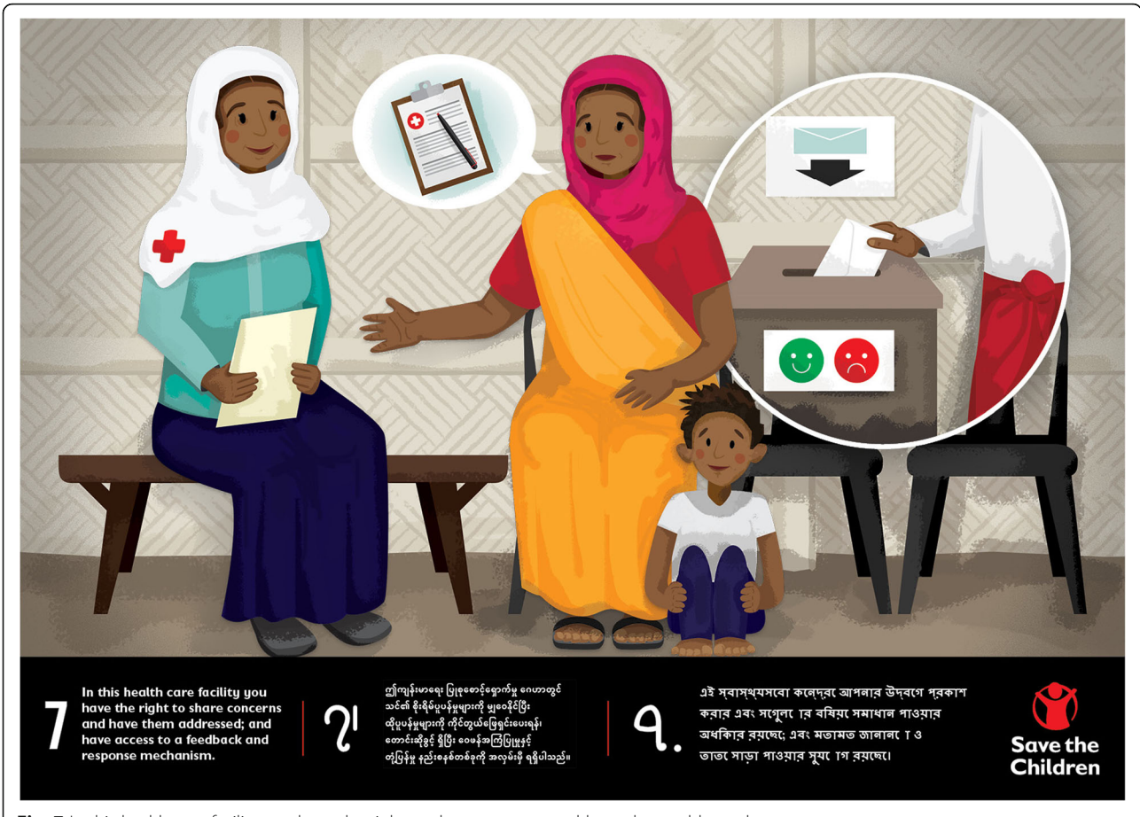
Fig. 7 In this health care facility you have the right to share concerns and have them addressed

medical teams which may not have experience operating in the contexts to which they have deployed, as well as for teams that draw on roster staff who may deploy infrequently.