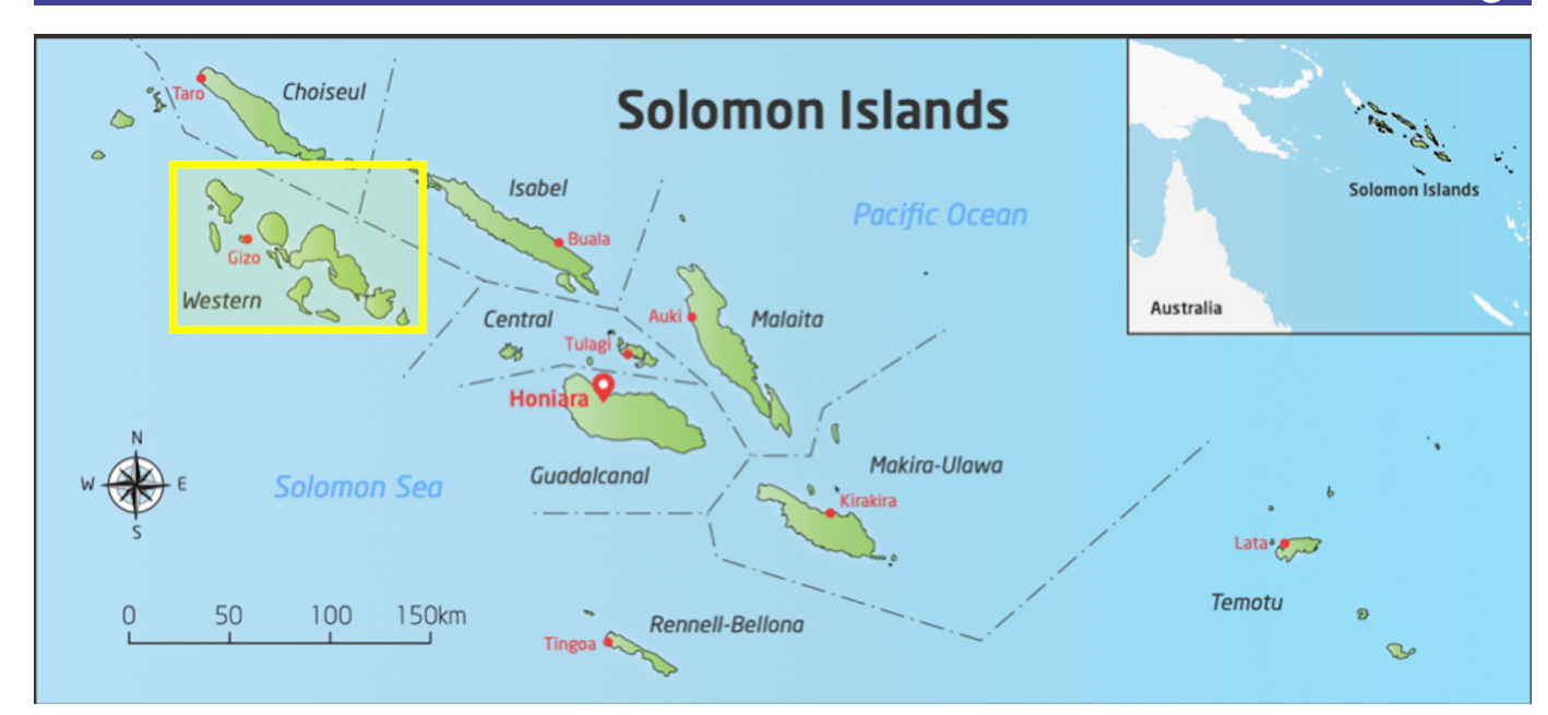
Figure 1 Study location in Solomon Islands.

This is a community-based study, with analysis conducted at the village level, and therefore, all residents are eligible to participate in the follow-up assessment at 12 and 24 months, regardless of whether they received treatment at baseline. Written informed consent will be obtained from all participants. Participants under the age 18 years will require written consent to be provided by a parent or guardian. Consent will be obtained at each study time point (baseline, 12 months and 24 months) (online supplementary file 1).