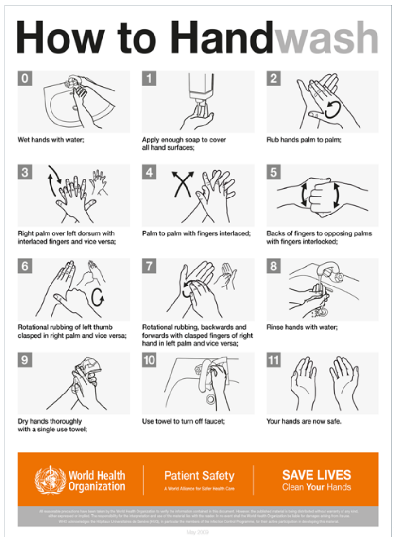
Figure 2 World Health Organization hand washing poster