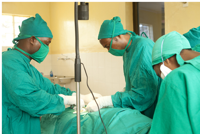
A woman undergoes tubal ligation by minilaparotomy in a health facility in northern Tanzania.

the most common reason why a provider requested that a supervisor assist with the procedure ( n=18 ; 66.7%).