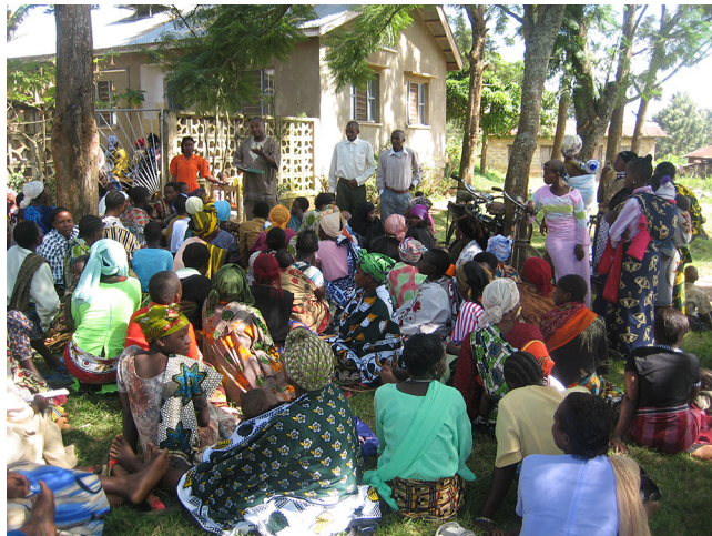
Health facility staff discuss family planning options with women waiting for outreach services in northern Tanzania.

procedures at other facilities where it was not routinely available.