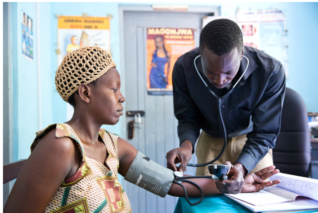
A clinical officer screens a woman for tubal ligation in a health facility in northern Tanzania.

ligation by minilaparotomy. None of the COs or AMOs had prior experience performing the procedure, although 4 of 7 COs and 6 of 7 AMOs had experience conducting other surgical procedures. The surgical experience of the COs was limited to minor surgeries such as drainage of abscesses or male circumcision, while the AMOs had experience conducting more complex surgery such as cesarean deliveries and appendectomies (Table 1). The 11-day competency-based training followed MOHCDGEC guidelines and standards. 24 In keeping with national and international standards, we also included in the training surgical assistants who would assist the COs and AMOs while they performed the minilaparotomies.