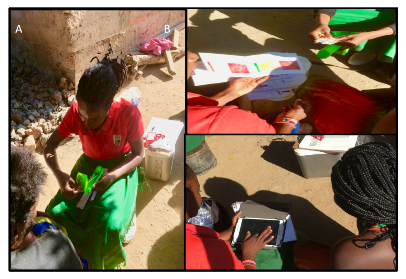
Figure 1. (A) The Bilharzia and HIV Community Workers (BCWs) demonstrating the use of genital self-swabs by using a 3D model; ( B ) BCWs teaching by using the WHO female genital schistosomiasis atlas; ( C ) BCWs delivering questionnaires in hand-held tablets. Photo credit: A. Bustinduy; oral permission was obtained from subjects to publish these images. Images have also been edited (pixelated and cropped) to keep the identity of the subjects anonymous.