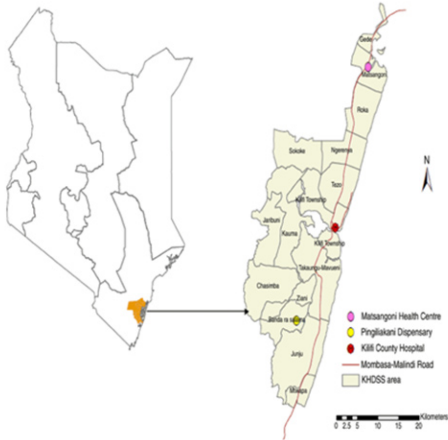
Figure 1. Study area.

that were up-loaded weekly with the most recent version of the KHDSS database to identify and match resident young adults who visited these health facilities. All consenting patients aged 18–24 years were eligible to participate in the study.