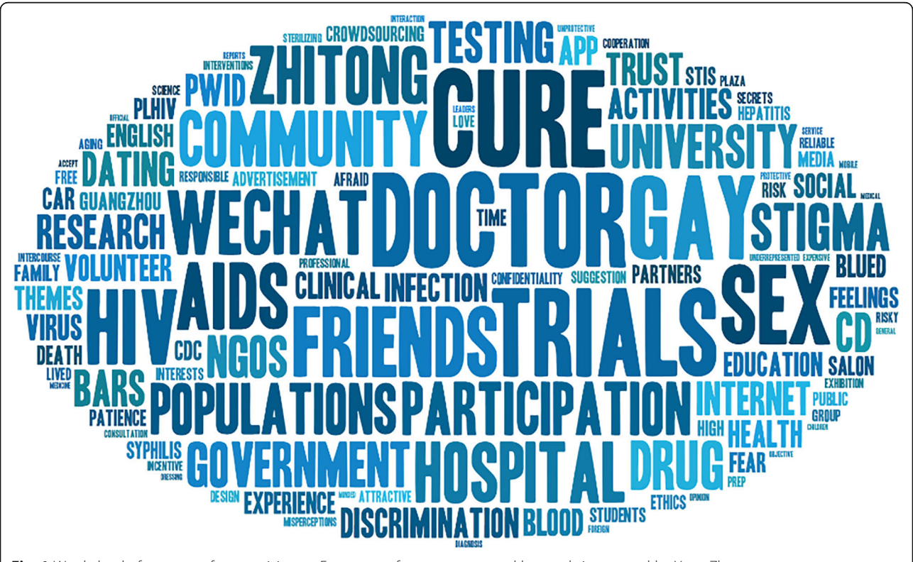
Fig. 1 Word cloud of responses from participants. Frequency of usage represented by word size, created by Yang Zhao through www.taqxedo.com

Zhao et al. BMC Public Health (2020) 20:67 Page 4 of 9