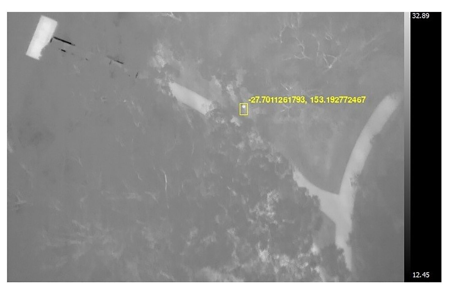
Fig 1. Airborne thermal image. Example of a thermal image of a koala captured by the Remotely-Piloted Aircraft Systems during thermal-imagery surveying of the study area.

The complete dataset of 82 koala observations contained 41 presences and 41 absences, each recorded at a unique location in the study area (S1 Table). Fifteen of the presences were identified from sightings made during opportunistic ground surveys conducted by citizen scientists between 2012 and 2017 [24]. Two more sightings were made by the project team in December 2017 while thermal imagery was captured (see below). The remaining 24 presences were identified from aerial thermal-imagery surveys conducted in October 2016 [23] and December 2017. On both occasions, thermal imagery was collected during RPAS (DJI M600) flights conducted over the study area for later identification of thermal hotspots as 'potential' koalas (Fig 1). A Tau-2 640 captured forward-looking infrared radiometer footage while a Mobius Action Camera and Sony NEX5 captured red-green-blue footage. The RPAS was flown at 60–70 m above ground to accommodate the size of the site within time constraints in the morning (between 5:50 am and 9:20 am; 2016 and 2017) and evening (between 3:53 pm and 5:56 pm; 2016 only), following line transects 8.37 m apart and orientated west-northwest to east-