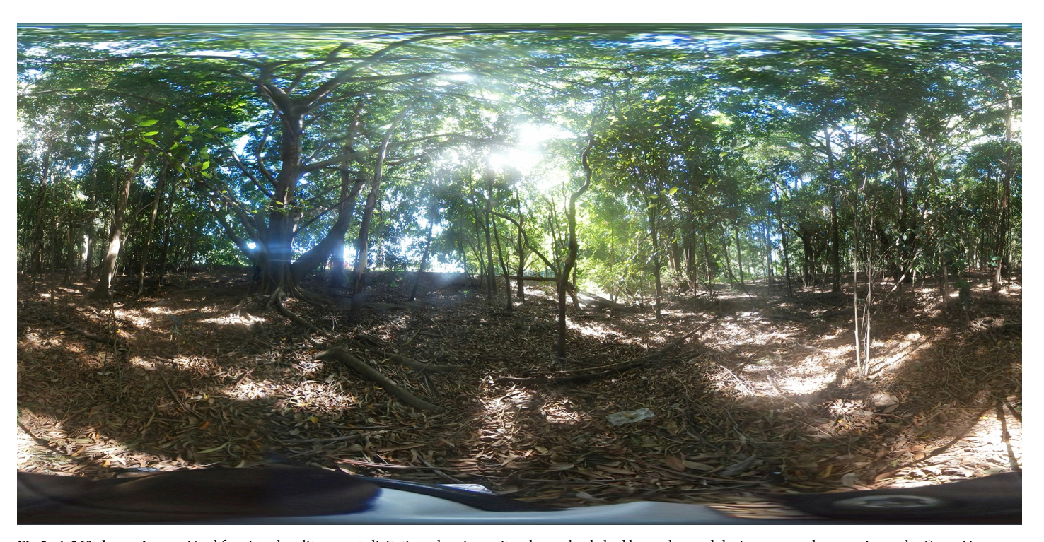
Fig 2. A 360-degree image. Used for virtual reality expert elicitation, showing a site where a koala had been observed during a ground survey. Image by Grace Heron, December 2017.

Subsets of images that captured the range of koala habitat at the 82 koala observation sites were shown to six koala experts. To generate the subsets, we used cluster analysis (complete-linkage unweighted pair grouping method with arithmetic mean and the Gower distance measure; [40]) to group sites based on vegetation height and density, distance to water, FPC, and koala presence or absence. The resultant clusters contained between 7 and 11 sites each. Images of sites were then captured in December 2017 using a Samsung Gear camera (Fig 2). Finally, we converted these images into 360-degree views using the game engine Unity (Unity Technologies, San Francisco, www.unity3d.com).