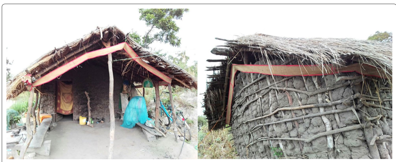
Fig. 3 Selected structures for evaluating the use of transfluthrin-treated eave ribbons installed along the eaves spaces of farm huts for preventing mosquito bites indoors and outdoors

Each night, indoor and outdoor mosquito collections were done between 18.00 and 07.00 h using CDC^{\otimes} light traps (CDC-LT) [43] and carbon dioxide-baited BG^{\otimes} malaria traps (BGM) [44, 45], respectively. Each morning, the collected mosquitoes were sorted by sex, and all