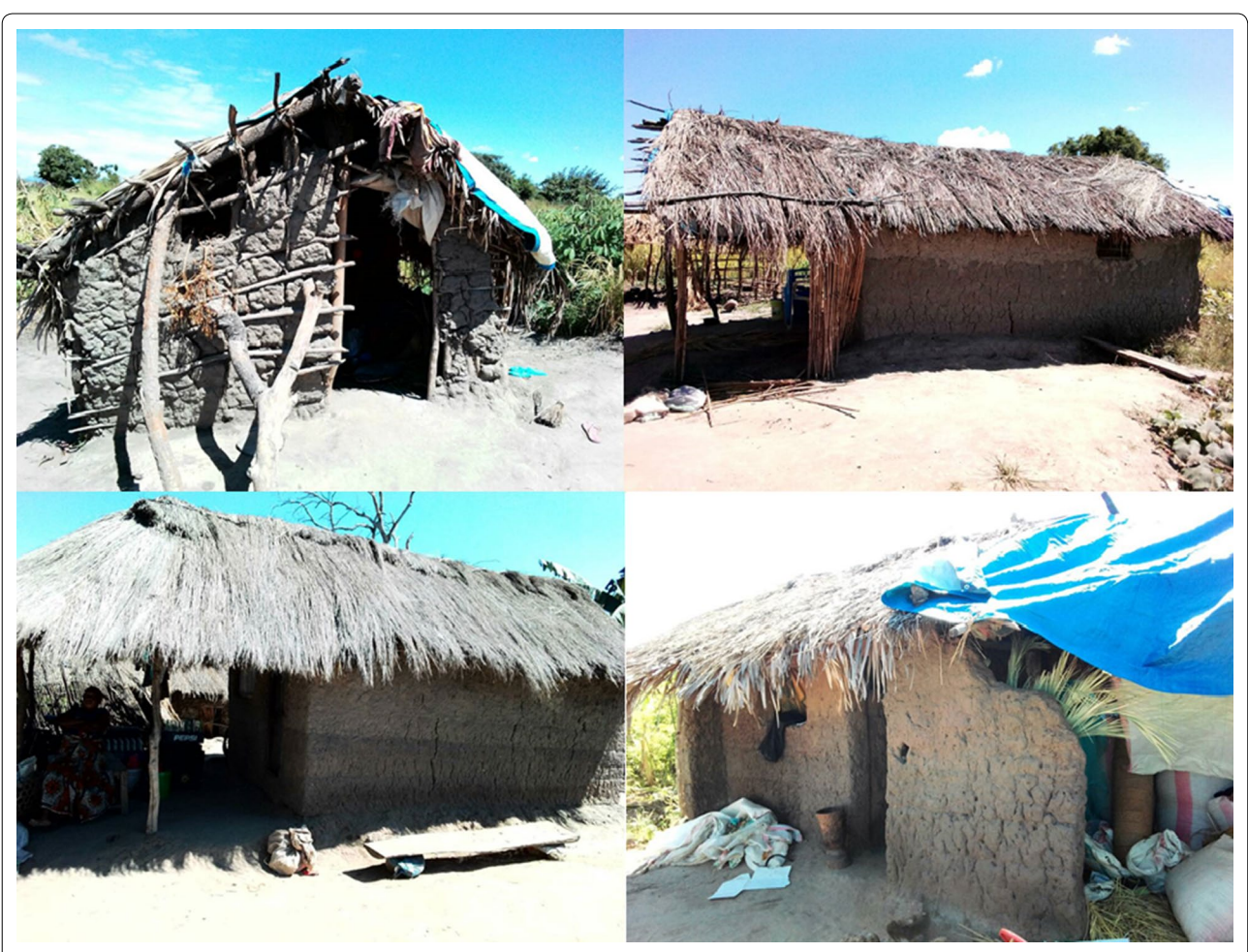
Fig. 1 Examples of makeshift housing structures that the migratory farmers use when they go to the farms in the distant river valleys

In rural southeastern Tanzania where subsistence rice cultivation is a common economic activity, families often relocate to their farms in distant river valleys for weeks or months (usually between January and June), to tend to their crops, only returning to their main residential homes at the end of the farming season. In most cases, parents bring with them their children below school age. While at the farms, these families usually dwell in temporary structures (Fig. 1), leaving them disproportionately more exposed to mosquito bites than the rest of the population [16]. In some of these structures, use of standard prevention tools, such as ITNs, is also compromised [16]. Affordable alternatives are therefore necessary to