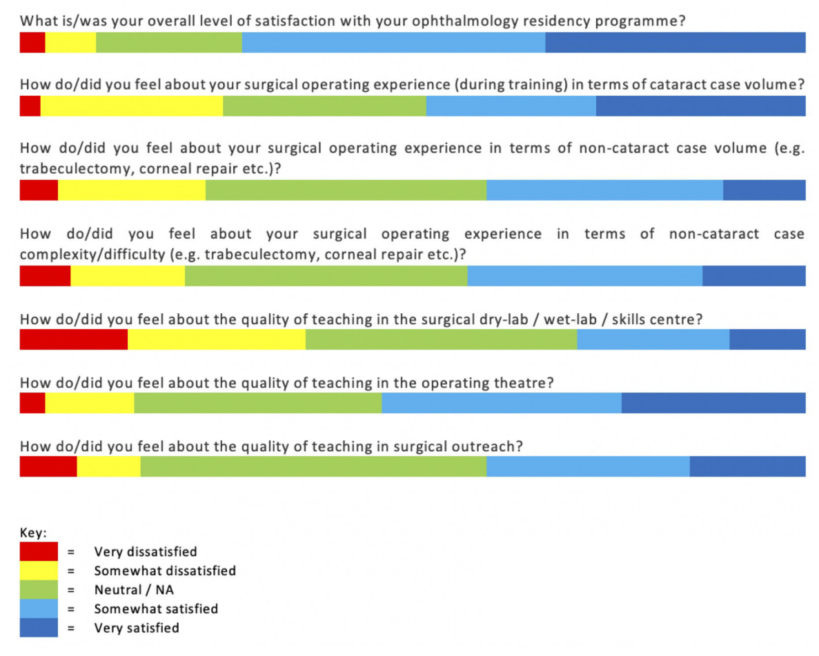
Figure 1. Horizontal bar diagram illustrating proportions of response on a five-point Likert scale.

The numbers of procedures performed (during training) were reported (Table 2). Of note, during the first two years of training, median cataract procedures performed was zero. For the 23 (60.5%) first and second year trainees who had performed