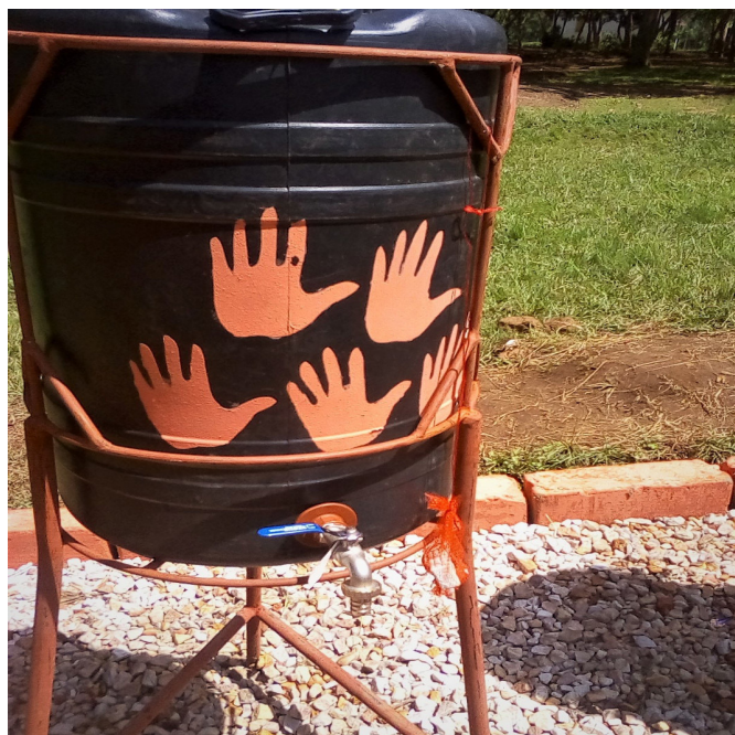
Figure 1 Handwashing facility with ‘nudges’ installed in the intervention schools.

The goal of our study was to explore the mechanisms by which and the extent to which the Mikono Safi intervention influenced the determinants of children’s handwashing behaviour. Our primary research question was: to what extent has the Mikono Safi intervention influenced the capability, opportunity and motivation for HWWS among pupils attending intervention schools? Findings from this research will be used to modify current intervention approaches, to further understand the extent to which school-based interventions influence individual drivers of behaviour, and to provide contextual information for interpreting forthcoming trial results.