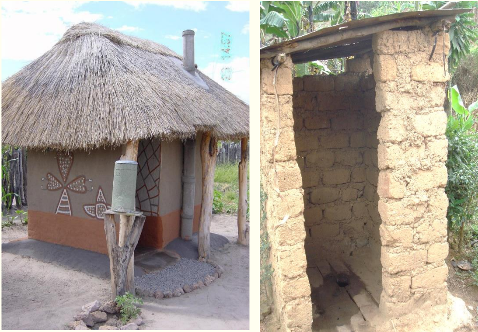
Figure.2. Left: Subsidized Ventilated Improved Pit latrine (VIP) in a CHC home in Zimbabwe with lined pit, concrete slab and vent pipe - a fly trap which eliminates smell and a hand washing facility.

Hygiene and sanitation standards between the two countries vary considerably. In Zimbabwe the Government recommended standard for sanitation is a Blair Ventilated Improved Pit (BVIP) latrine which usually has brick lined pit with cement slab, whilst the superstructure is likely to be permanent constructed in bricks, often plastered with cement with a tin roof and vent pipe primarily used as to draw a fly trap so reducing fly breeding but also draws off the smell.