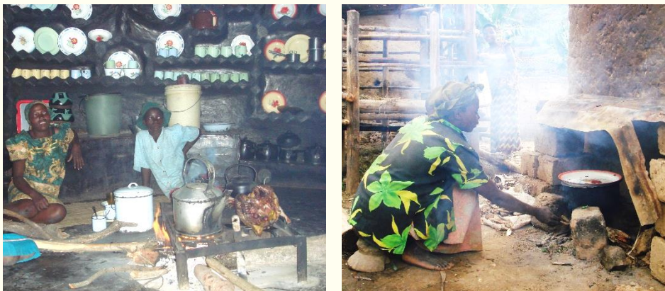
Figure 3: Left: A model CHC kitchen hut in Zimbabwe showing shelving made of clay, individual family utensils and covered drinking water with ladle. Right: In Rwanda, a traditional cooking shelter outside, with no CHC improvements.

Zimbabwean households usually have a dedicated kitchen with an open fireplace in the centre of the round thatched cooking hut. Seating for men is a moulded bench around the walls, whilst women and children sit on the ground by the fire, and chickens enter freely. The hut is usually very smoky causing a high rate of acute respiratory infections ( See Figure 2. ). Traditionally, cooking huts were highly decorated with built-in clay shelving in the walls and this practice has been reinvented by the CHCs with all members upgrading their kitchens in ever increasing levels of excellence.