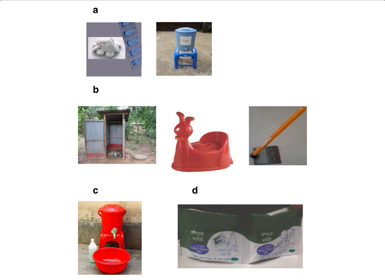
Fig. 1 WASH Benefits interventions products. a chlorine tablets and water storage container. b double-pit, pour-flush latrine, child potty and sani-scoop. c handwashing station. d lipid-based nutrient supplement (LNS)

These included observations of the presence, functionality, condition and signs of use of delivered hardware using a structured evaluation. For double-pit latrine functionality this included observation of an intact functional water seal (Fig. 2, Table 1). We conducted qualitative studies to develop specific definitions of 'easily accessible to mother,' defined as producing technologies/supplies within 10 s for child potties, sani-scoops, or the stock of LNS sachets, and checked for adequate delivery. These fidelity indicators and benchmarks were also used to monitor uptake throughout the trial, result of which are reported elsewhere [14].